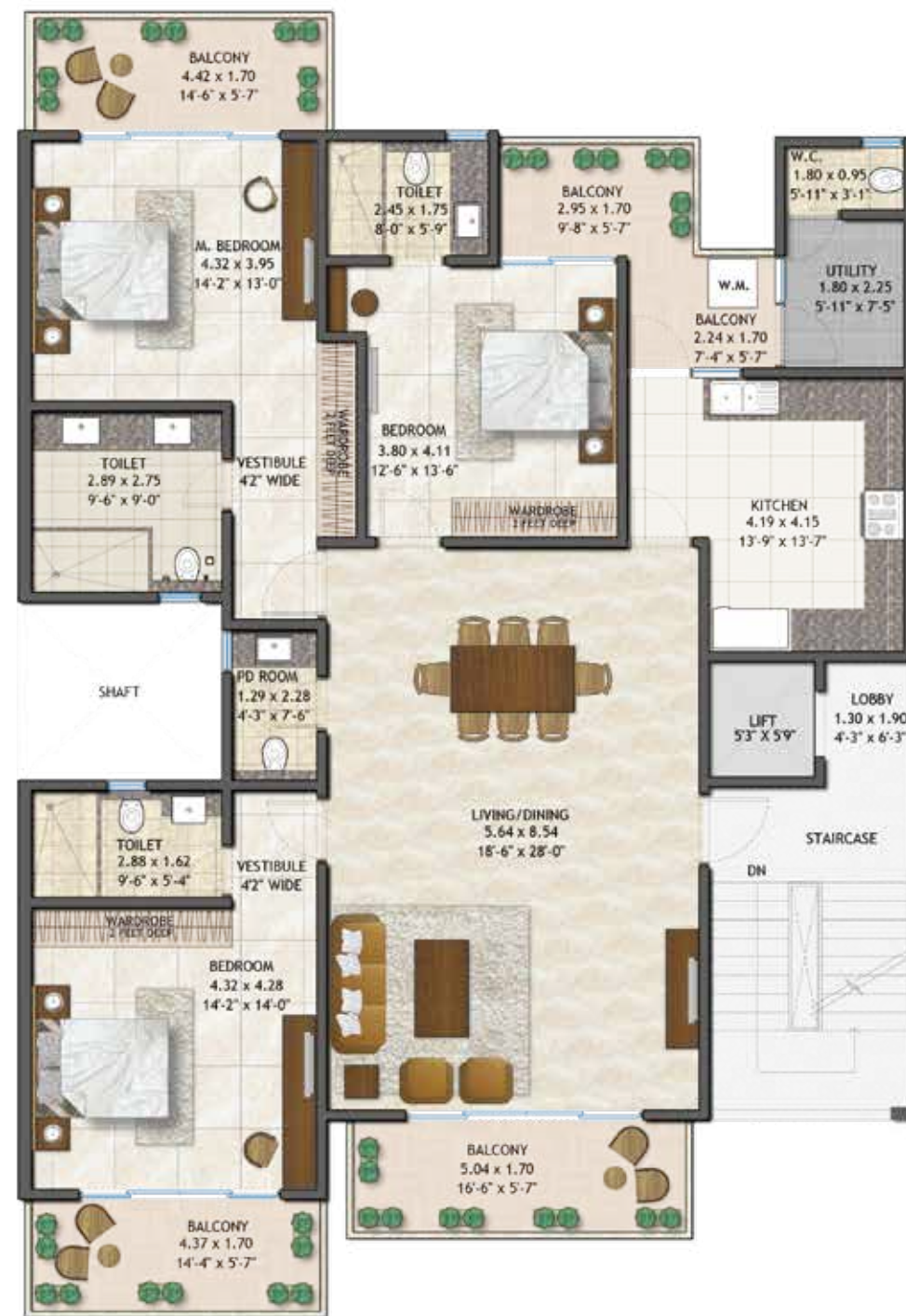
FIRST, SECOND, THIRD & FOURTH FLOOR PLAN