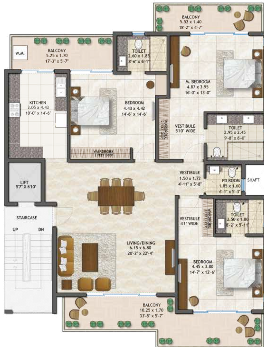
FIRST, SECOND, THIRD & FOURTH FLOOR PLAN