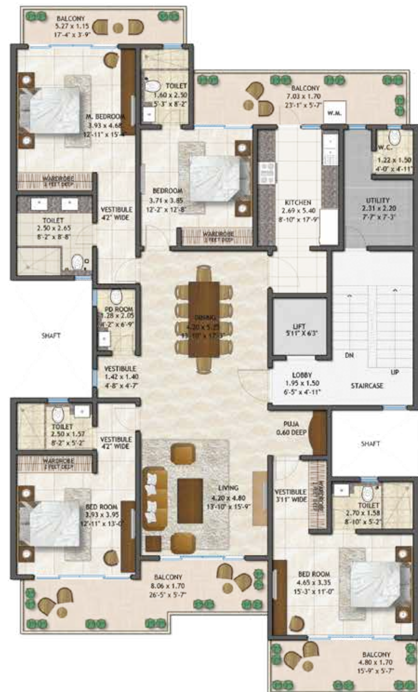
FIRST, SECOND, THIRD & FOURTH FLOOR PLAN