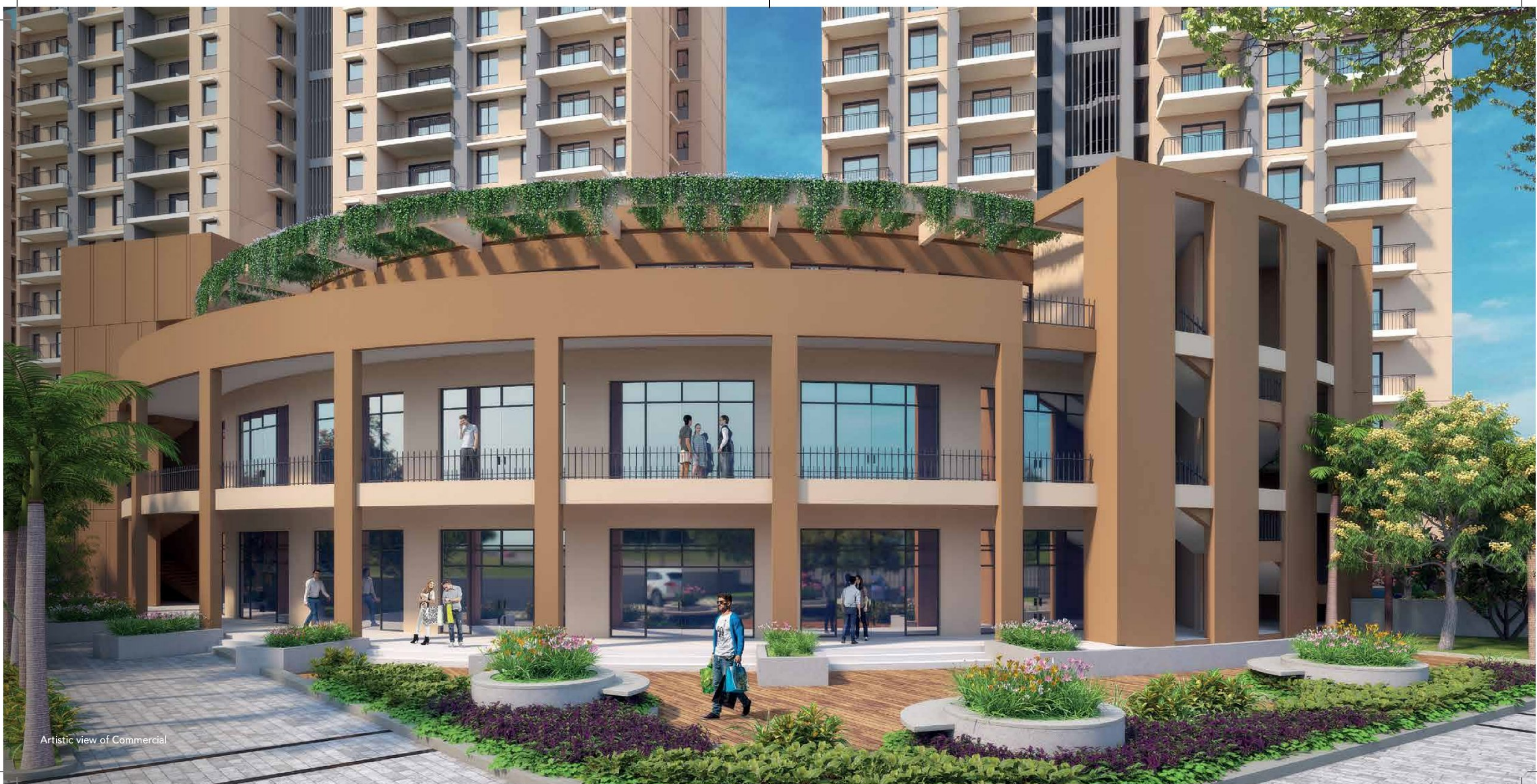
Artistic view of Commercial