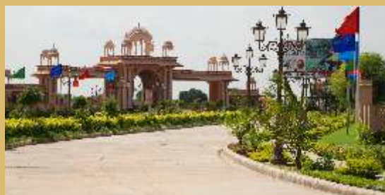
Suncity Township, Sikar Road, Jaipur

Suncity Projects is one of the most eminent real estate companies in North India. The Group has built an unshakable reputation for quality, efficiency, trust and meticulous planning. Suncity Projects in North India are famous for offering top quality amenities, superlative designs, timely completion, guaranteed possessions and handing over of projects ranging from Townships to Group Housing to Luxury Apartments. In Corporate & Retail space Suncity Projects offers Shopping Malls to Office Complexes.