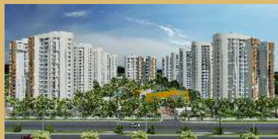
Parikrama, Sector-20, Panchkula