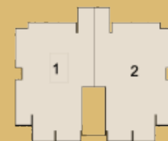
Key Plan Tower T14

3 Bedroom + 3 Toilet + Store / Puja Super Area = 1475 sq.ft