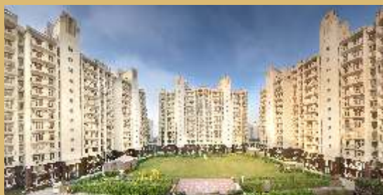
Essel Tower, M.G. Road, Gurgaon