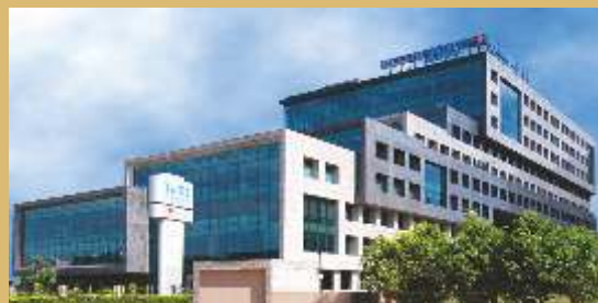
Time Tower, M.G. Road, Gurgaon