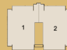
Key Plan Tower T15

4 Bedroom + 4 Toilet + Utility Super Area = 1950 sq.ft