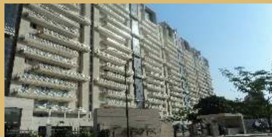
La Lagune, Golf Course Road, Gurgaon