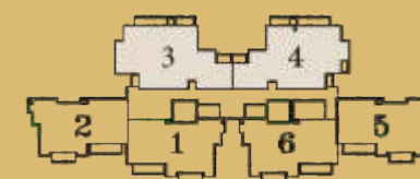
Key Plan Tower T1, T2, T3, T5, T6, T7, T8, T9, T10 & T12

3 Bedroom + 3 Toilet + Store Super Area = 1532 sq.ft