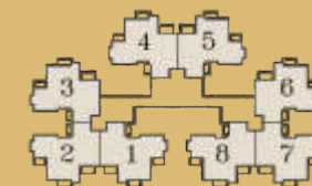
Key Plan Tower T4 & T11

2 Bedroom + 2 Toilet + Store Super Area = 955 sq.ft