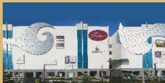
Triton Mall, Jhotwara Road, Jaipur