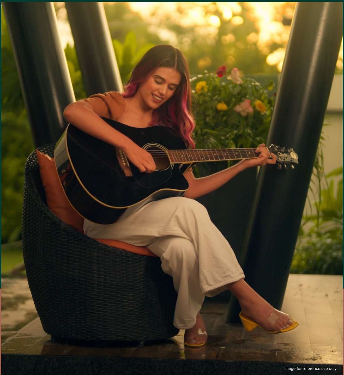
Image for reference use only