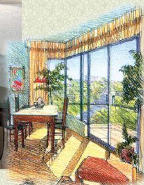
Simulated view of Rest Lounge

All you need to do is walk in and make it yours.