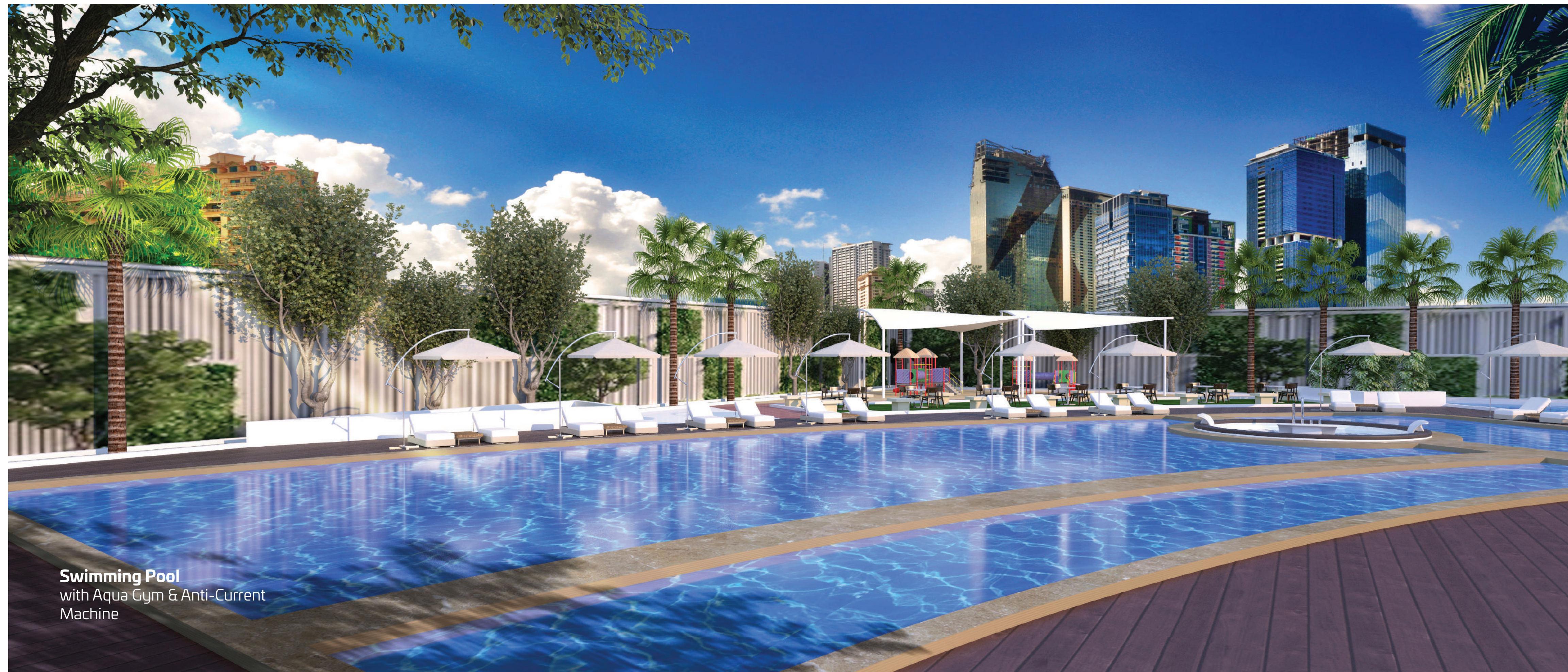
Swimming Pool with Aqua Gym & Anti-Current Machine