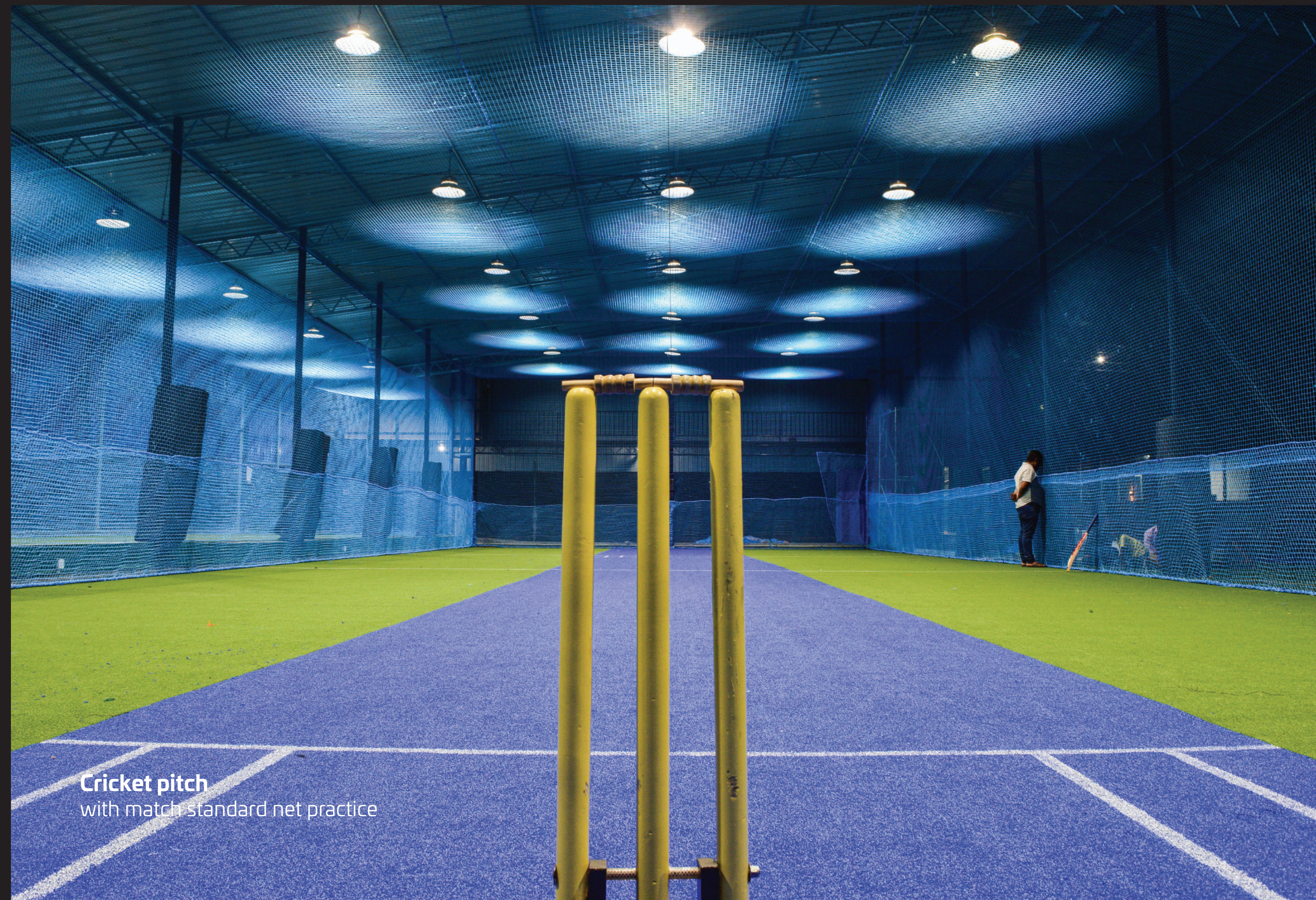
Cricket pitch with match standard net practice