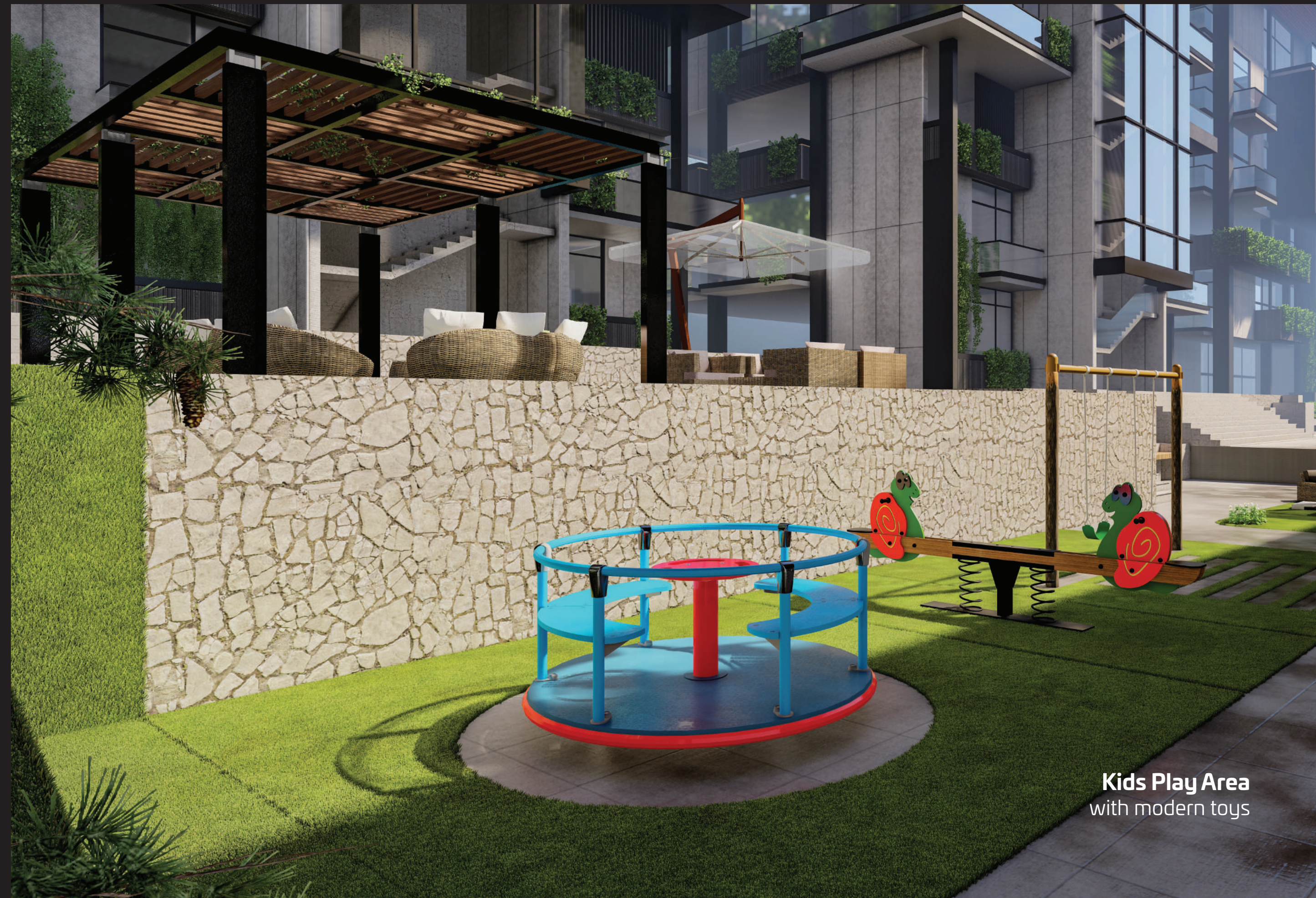
Kids Play Area with modern toys