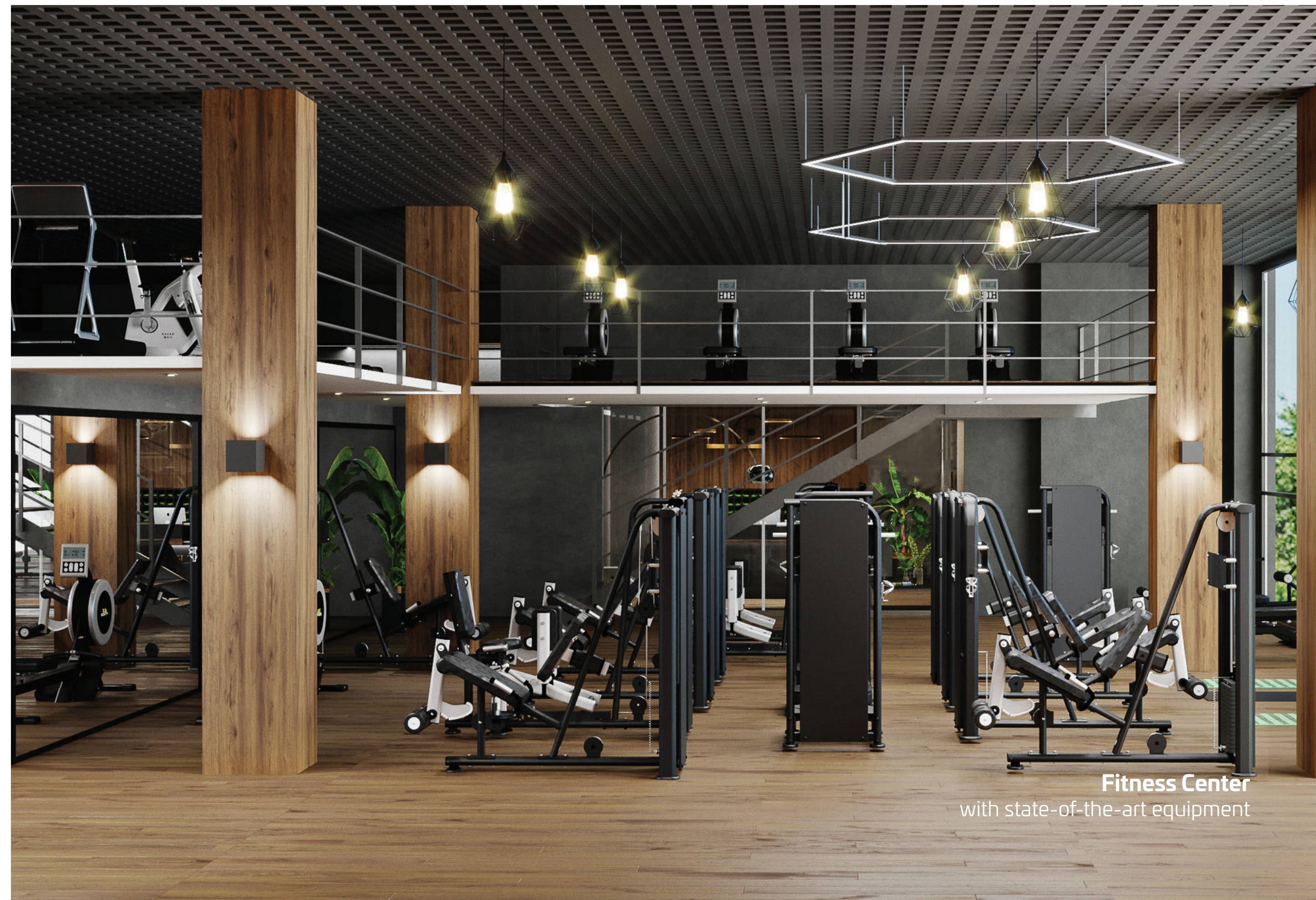
Fitness Center with state-of-the-art equipment