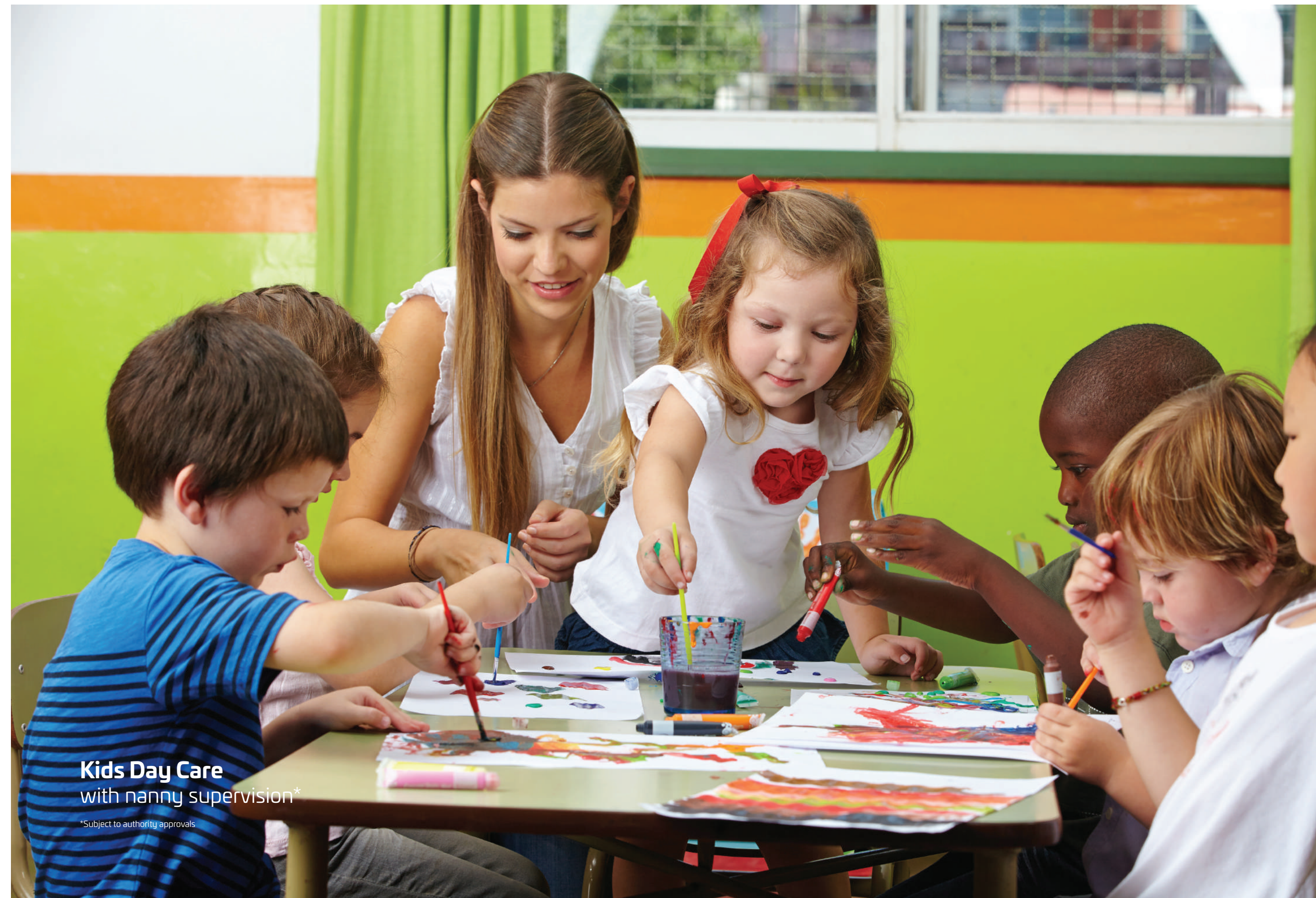
Kids Day Care with nanny supervision*