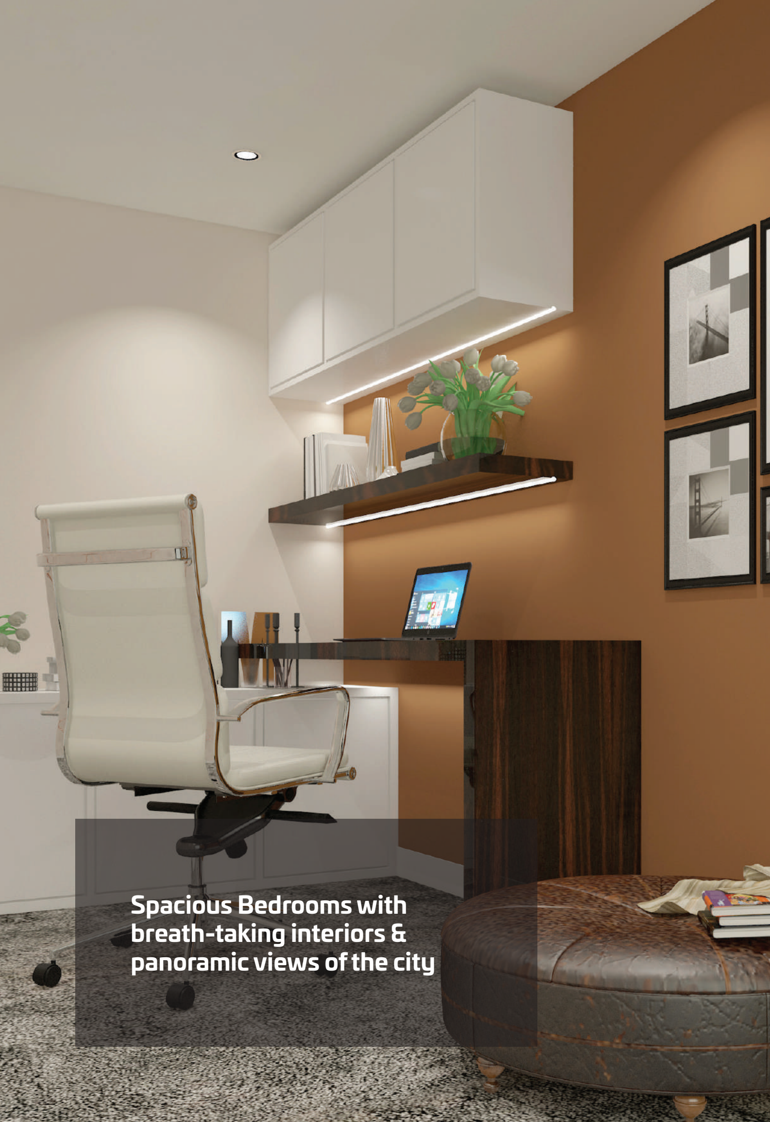
Spacious Bedrooms with breath-taking interiors & panoramic views of the city