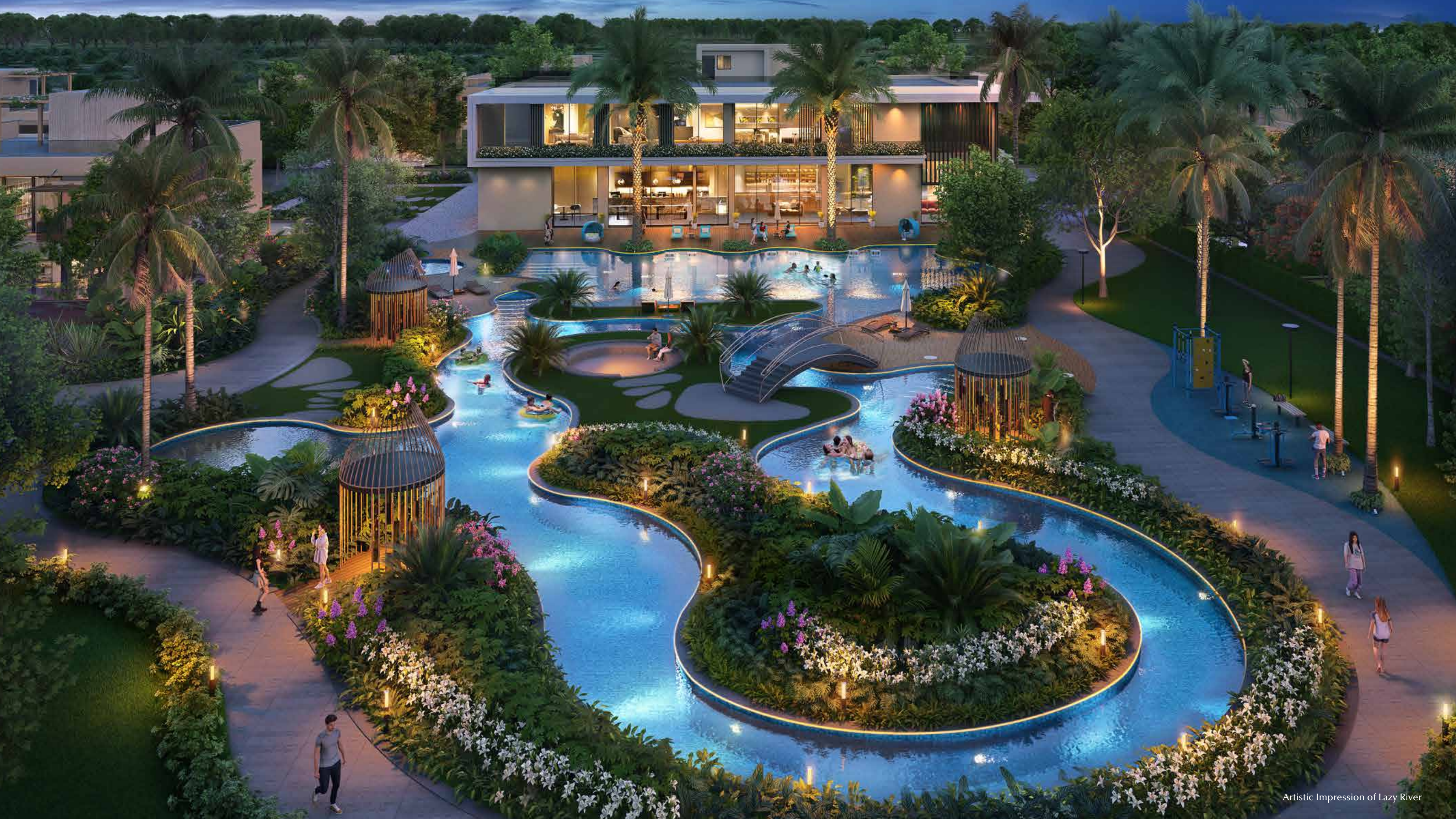
Artistic Impression of Lazy River