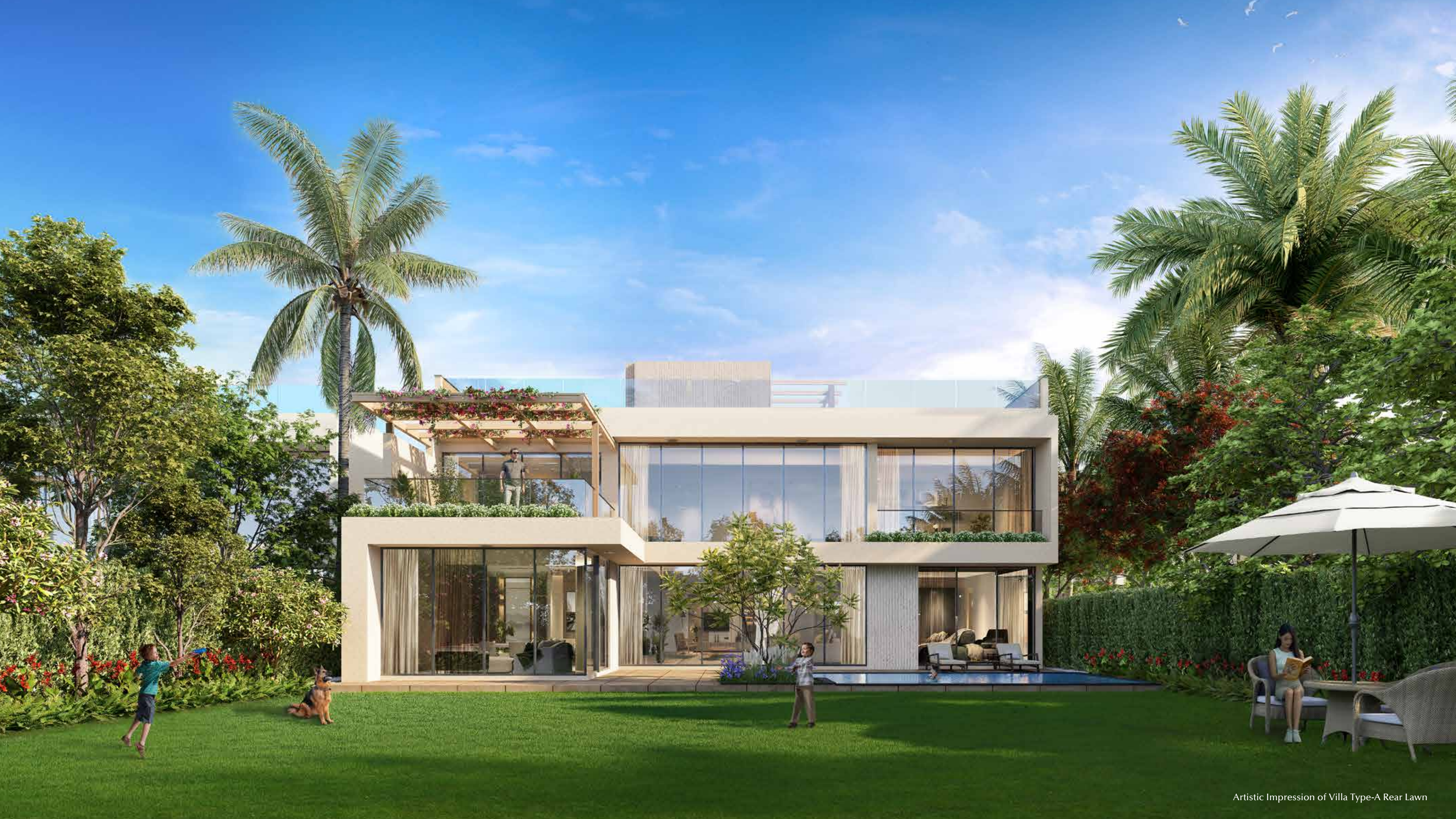
Artistic Impression of Villa Type-A Rear Lawn