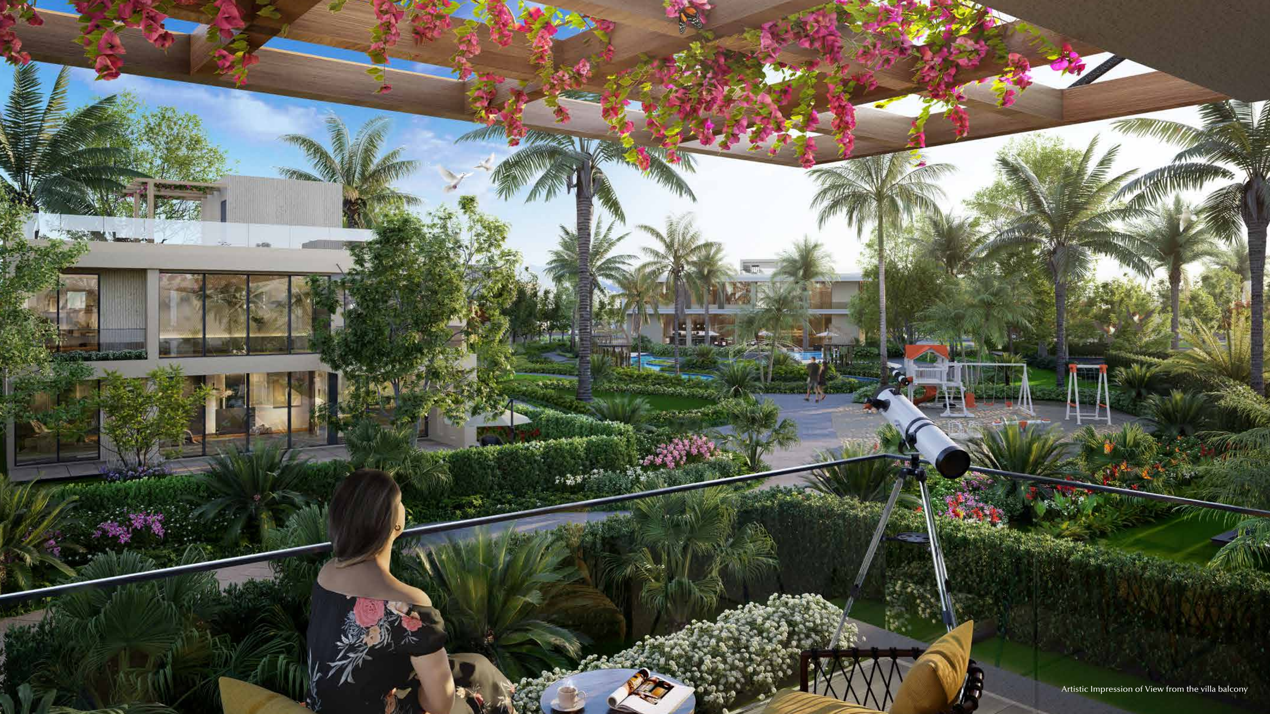
Artistic Impression of View from the villa balcony