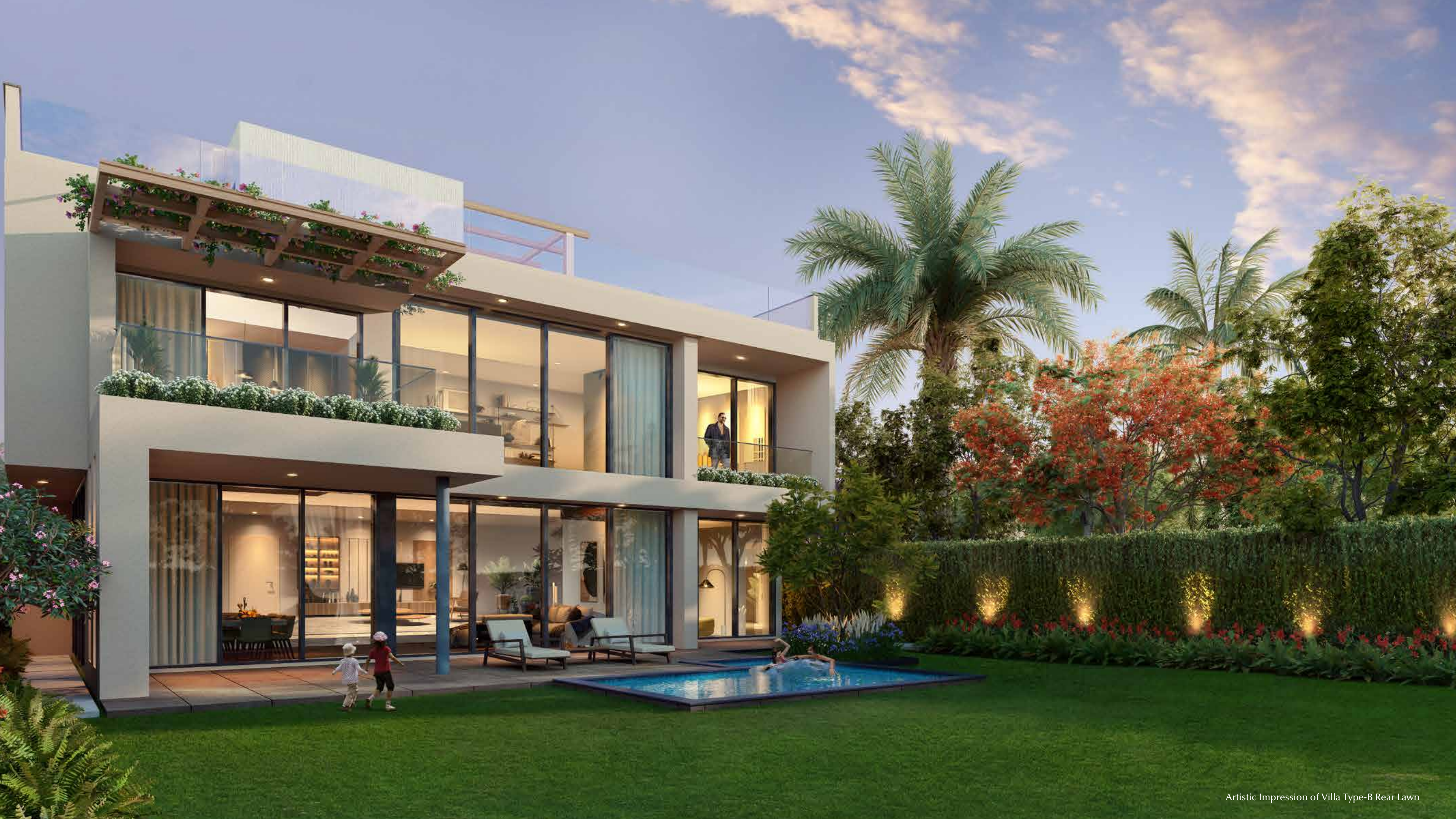
Artistic Impression of Villa Type-B Rear Lawn