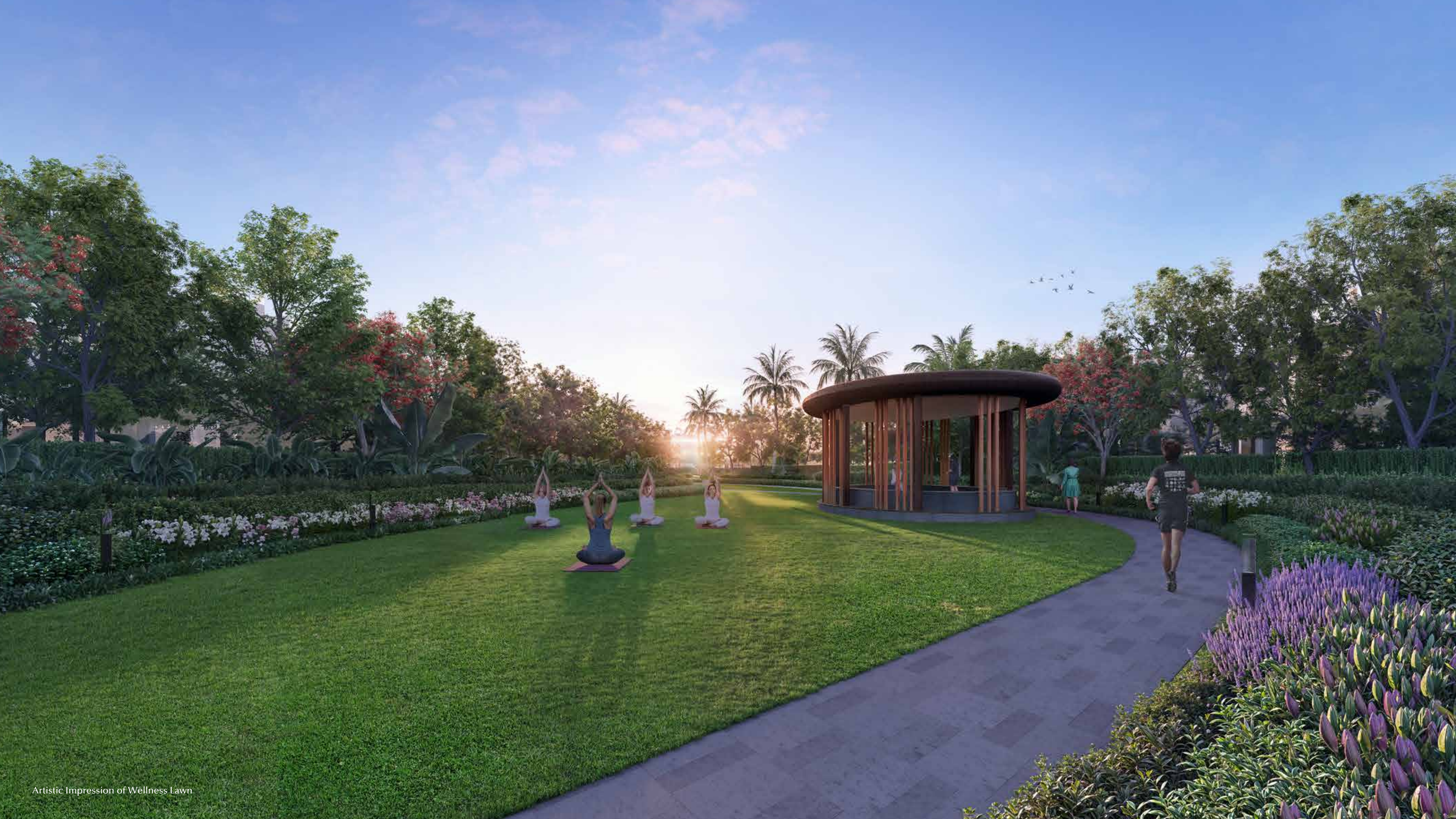
Artistic Impression of Wellness Lawn