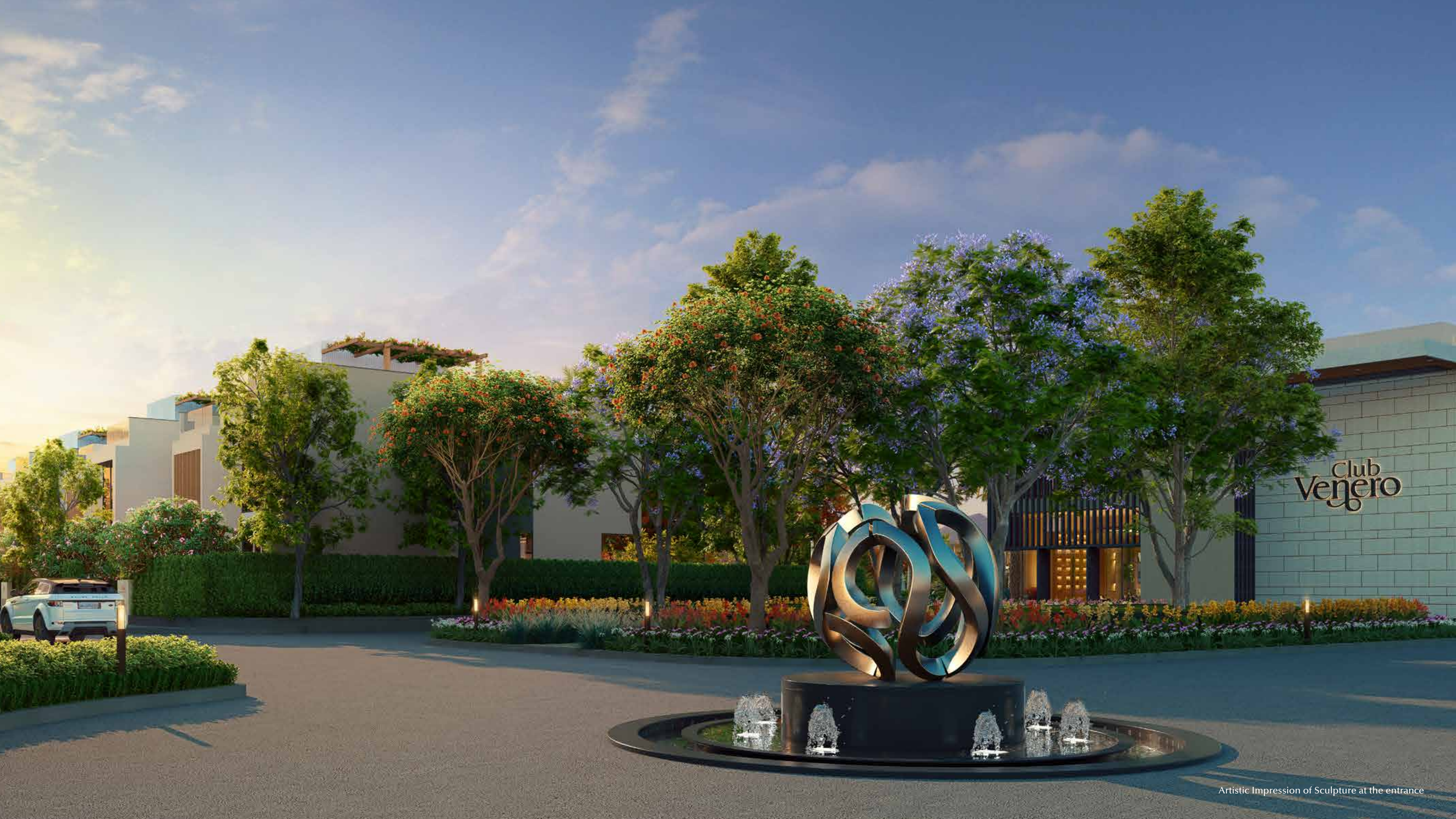
Artistic Impression of Sculpture at the entrance