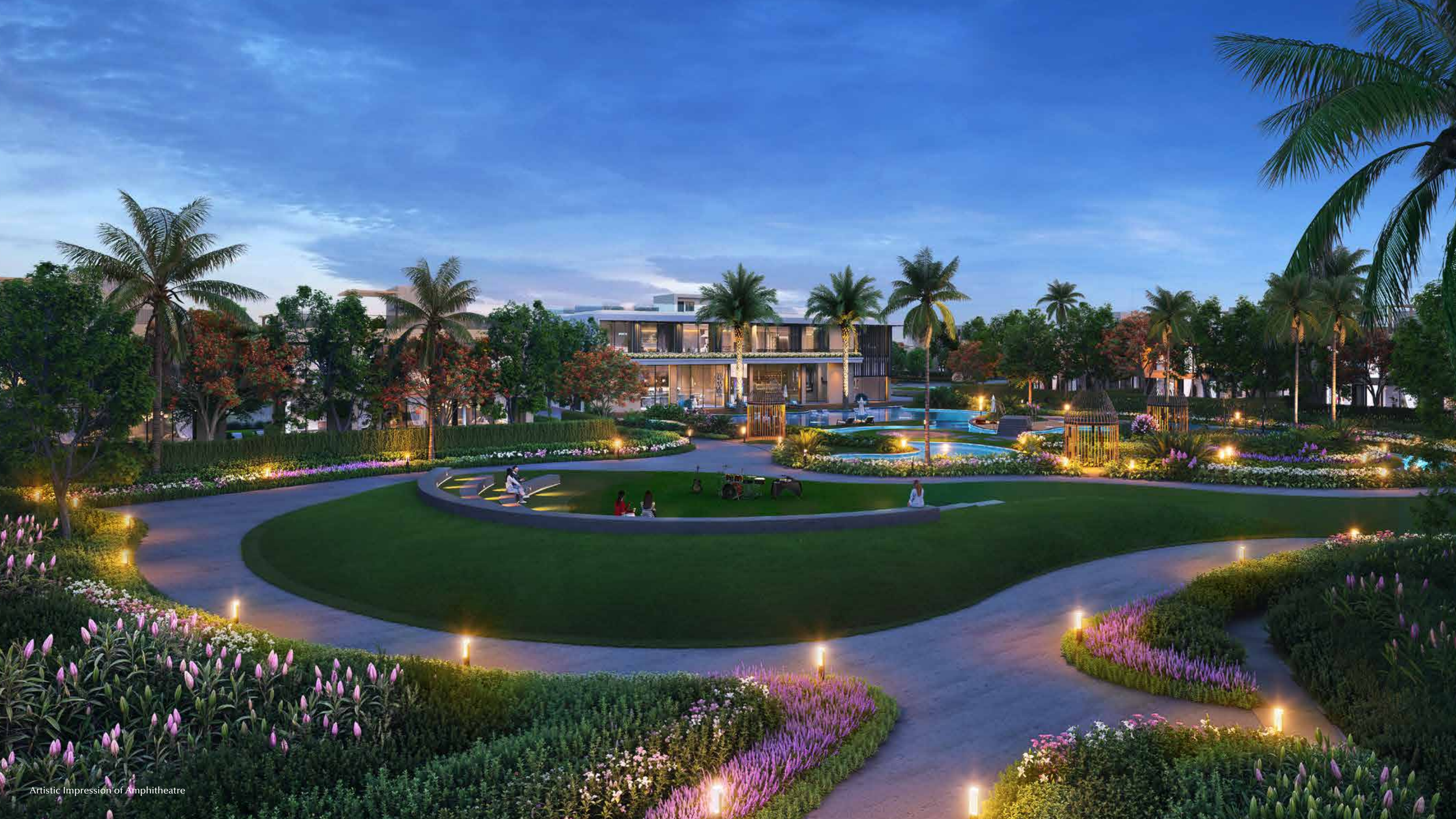
Artistic Impression of Amphitheatre