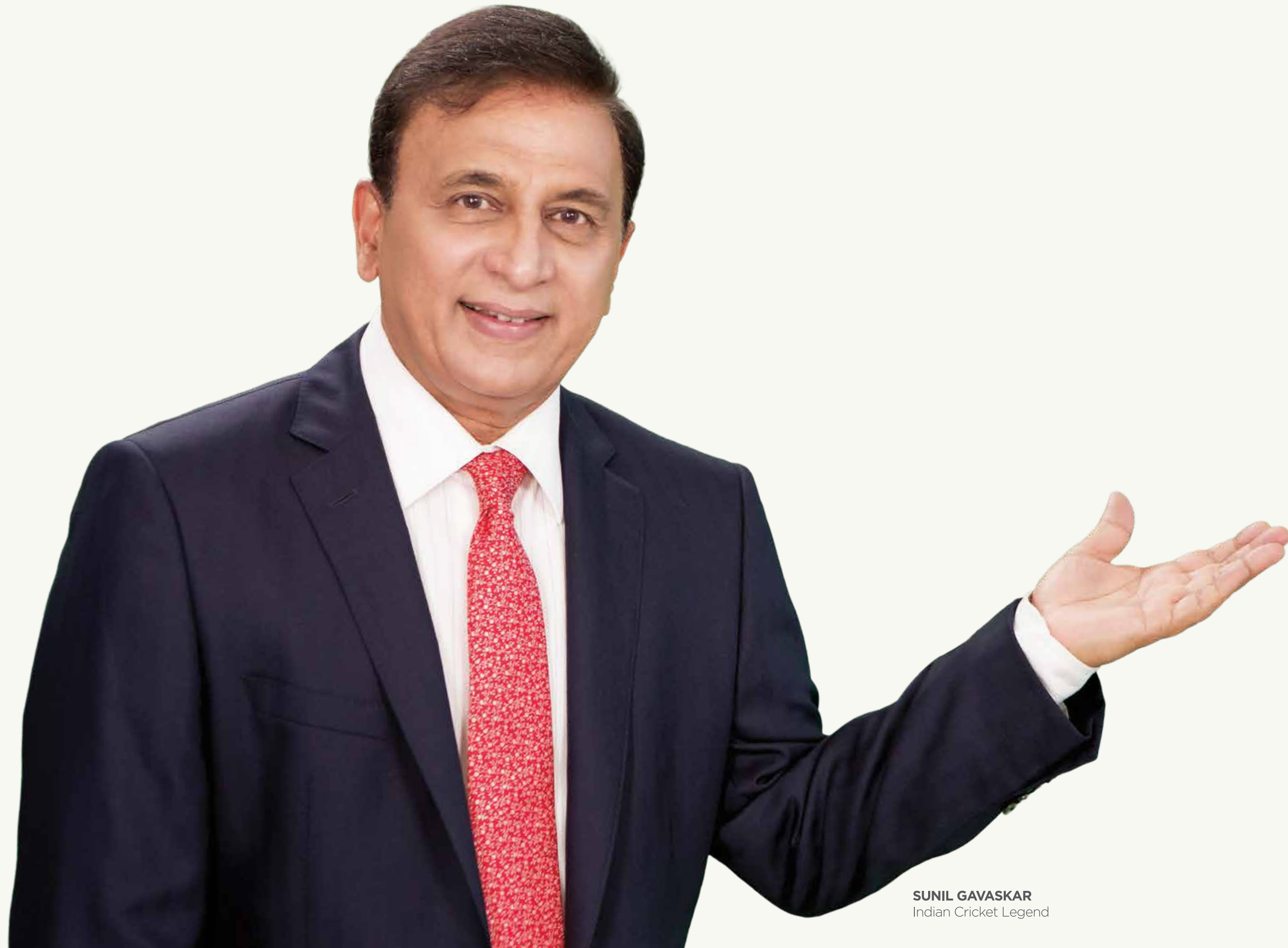
SUNIL GAVASKAR Indian Cricket Legend