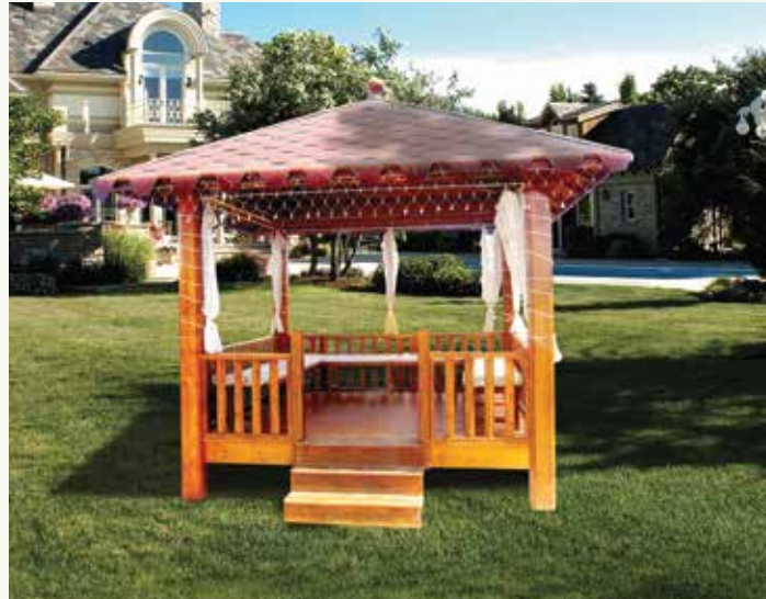
LANDSCAPED GARDEN WITH WOODEN GAZEBO

• CENTRAL AIR CONDITIONING • WARDROBES IN BEDROOMS • WALK-IN CLOSET IN MASTER BEDROOM • DOUBLE GLAZED WINDOWS • FULLY NETWORKED HOUSE