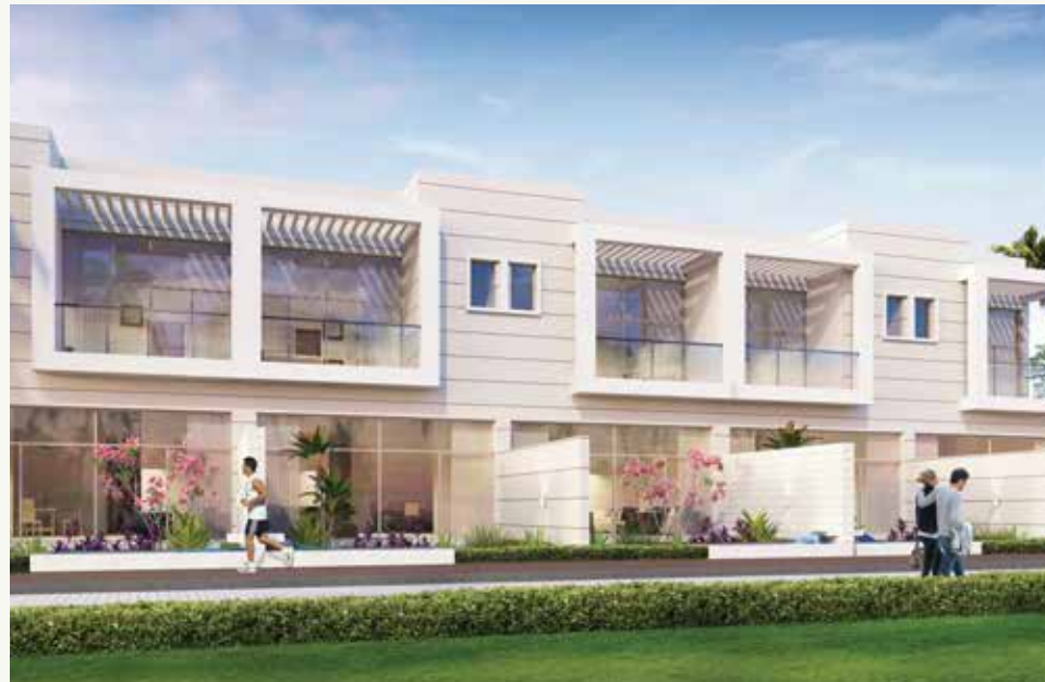
TYPE 3 - 3 Bedroom Townhouse