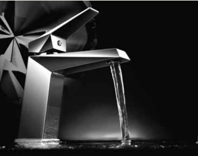
DESIGNER FAUCETS BY MILANO