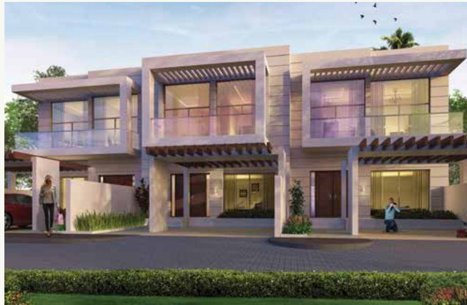
TYPE 1 M - 4 Bedroom Townhouse