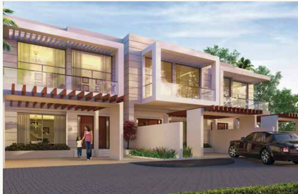
TYPE 1 E - 4 Bedroom Townhouse