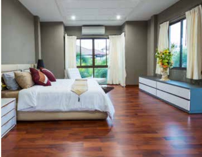
SWISS MADE PARQUET FLOORING