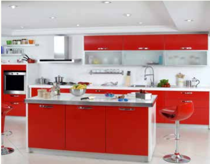
FULLY- FITTED MODULAR KITCHEN