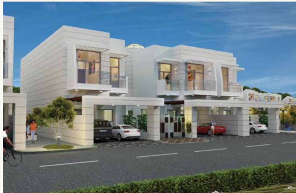
TYPE 2 - 4 Bedroom Townhouse