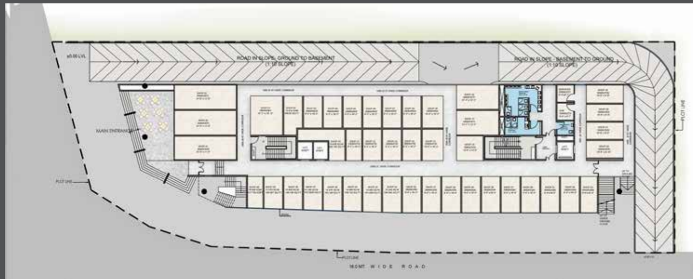
LOWER GROUND FLOOR PLAN