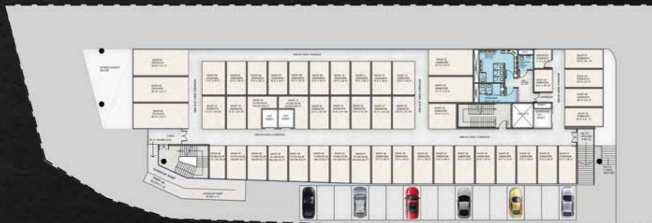
UPPER GROUND FLOOR PLAN