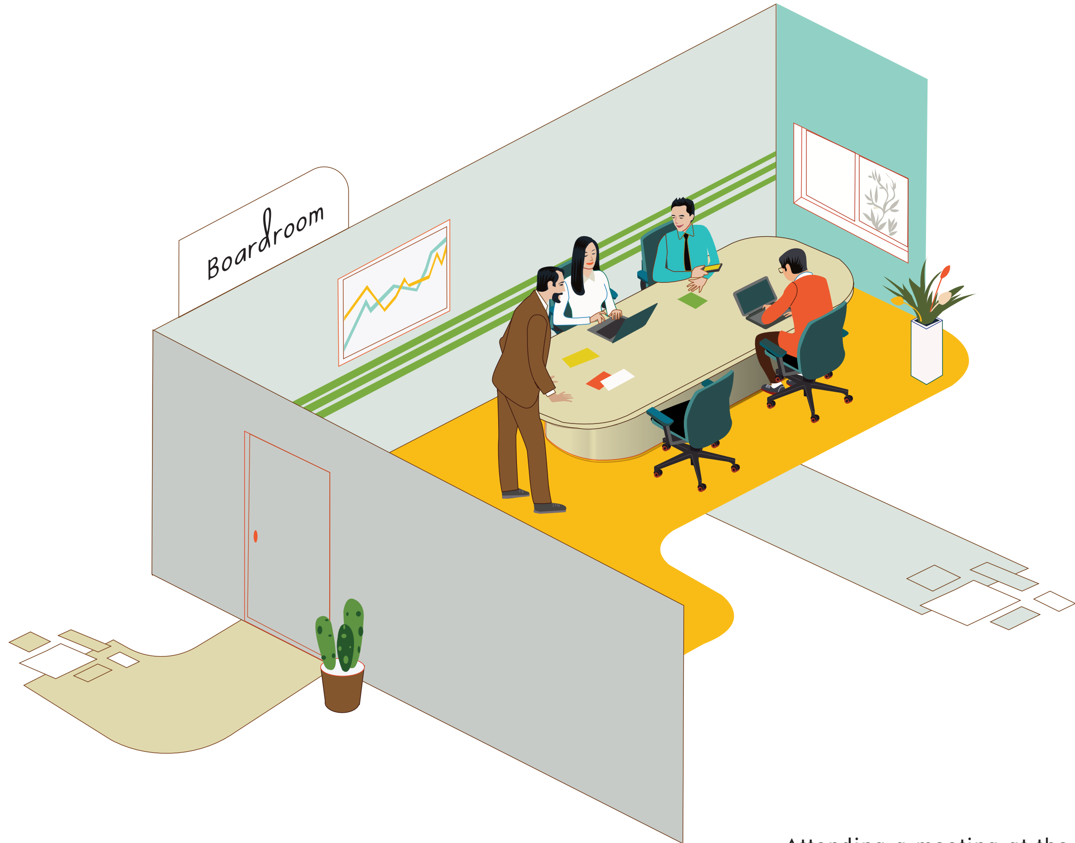
Attending a meeting at the Boardroom