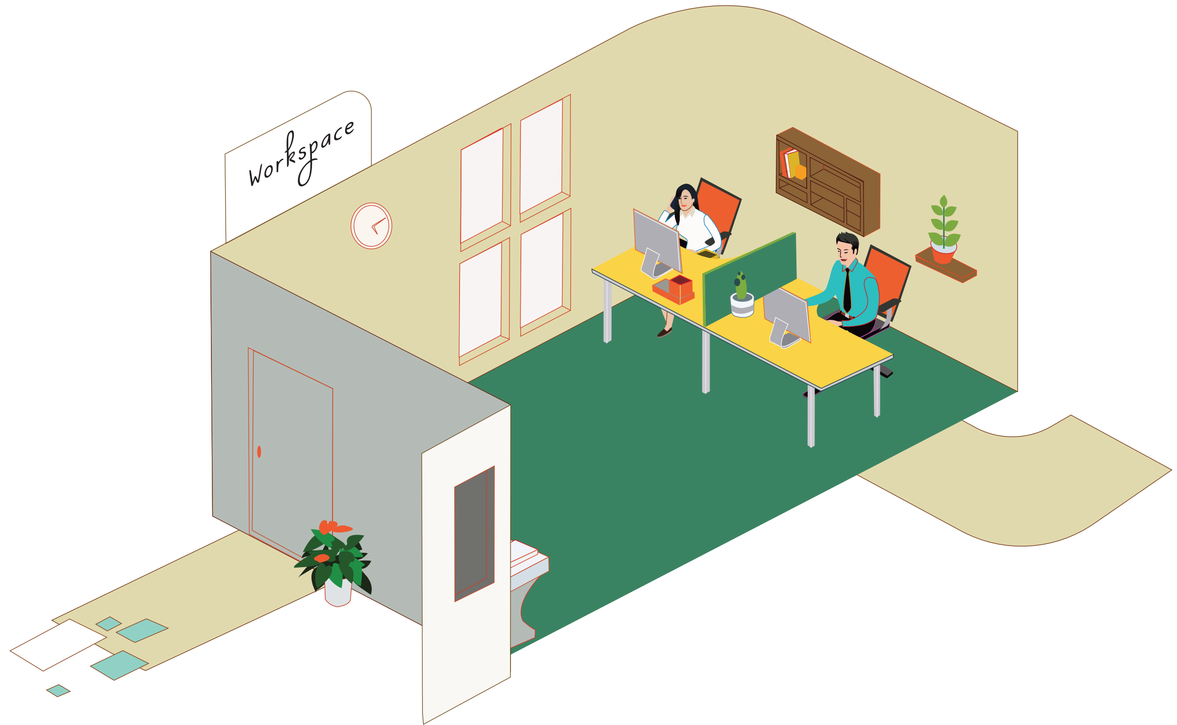
Beginning the workday at the Comfortable Workspace