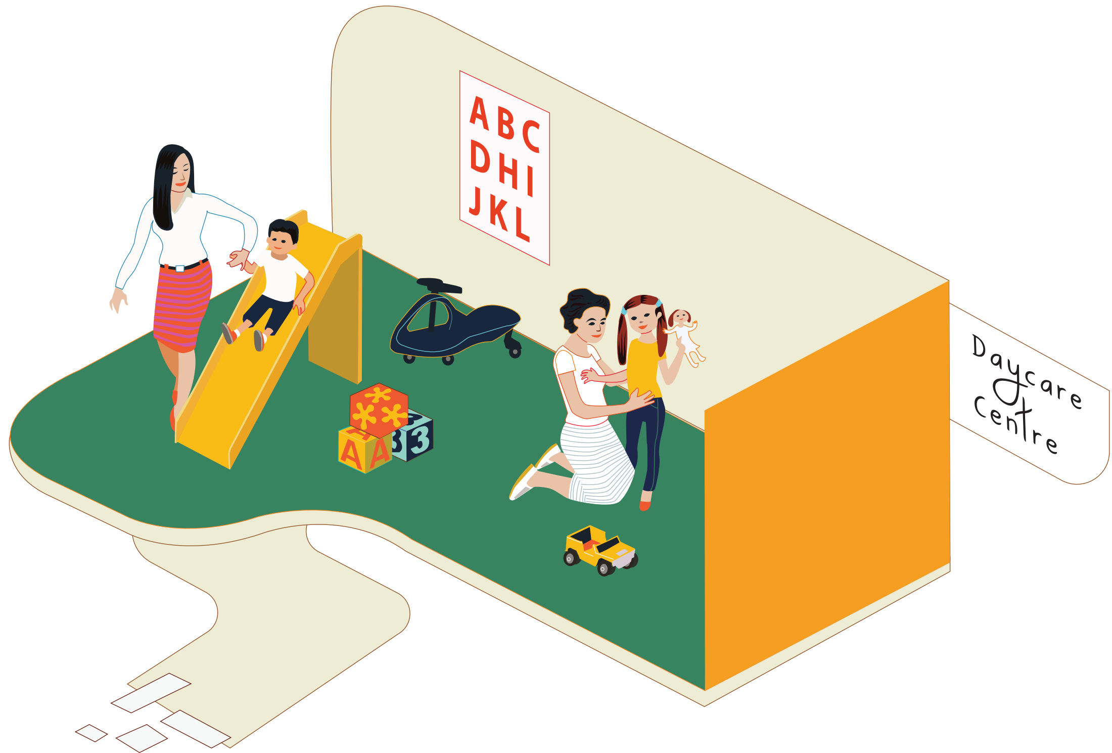
Dropping the kids at the Daycare Centre