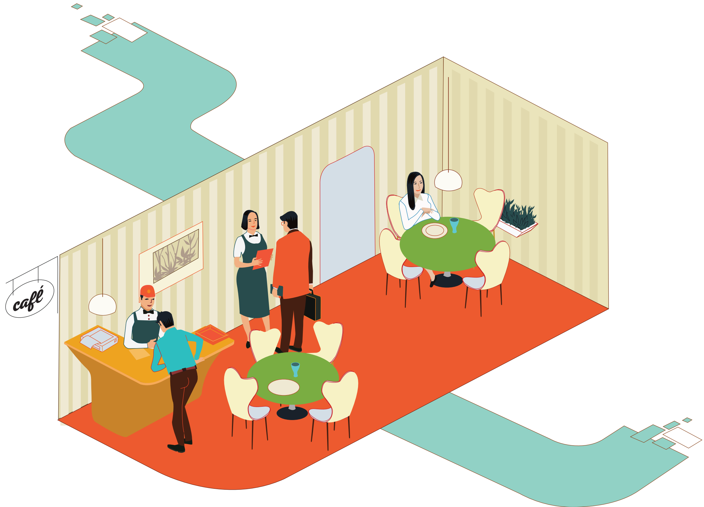
Enjoying the morning coffee at the Café