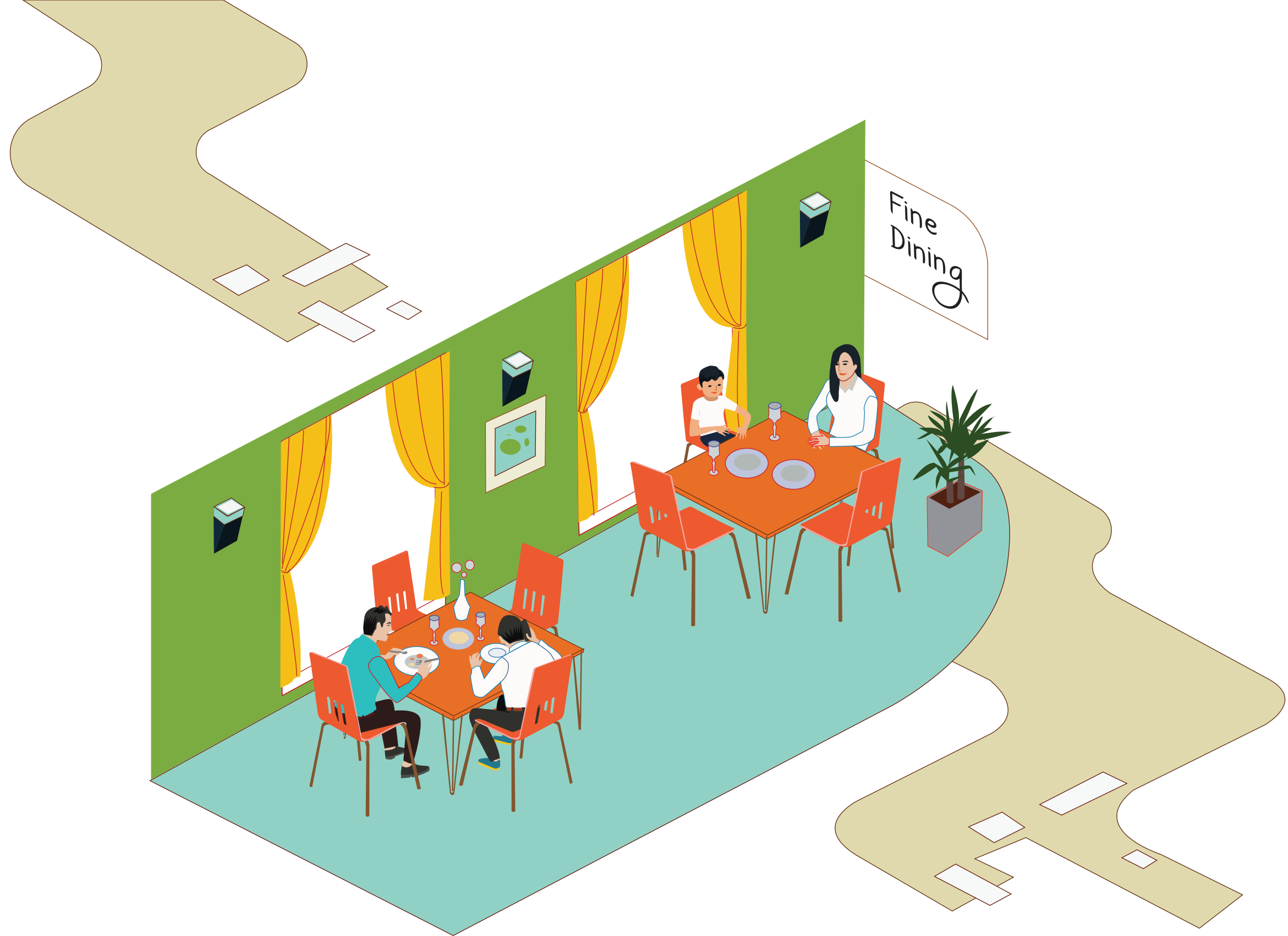
Relishing delicacies at the Fine Dining Arena