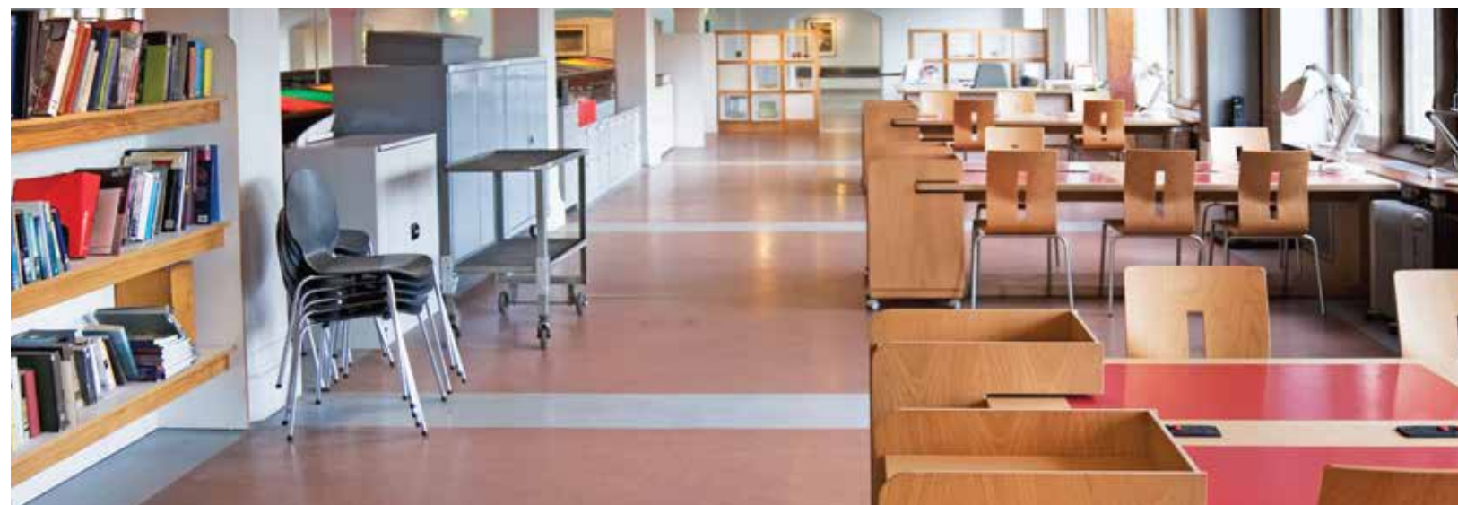
Photographs/artistic impressions contained herein are illustrative and used for indicative purpose only. This is purely conceptual and not a legal offering.

Great business ideas don't fit in pre-fixed sizes. Your workspace at Inspire BKC is crafted to accommodate and anticipate the diverse growth needs of your business.