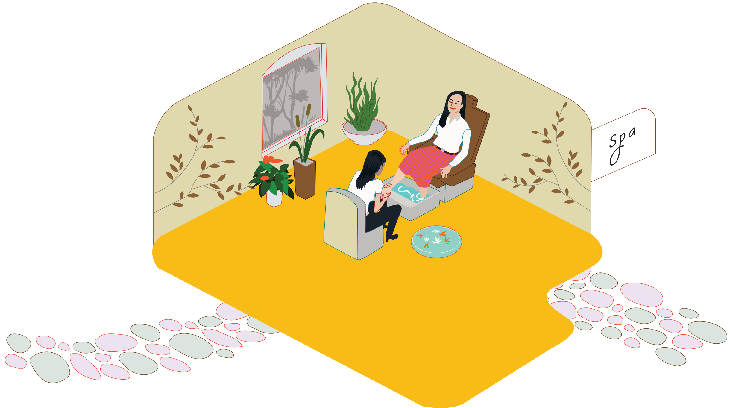
Unwinding at the Well-appointed Spa