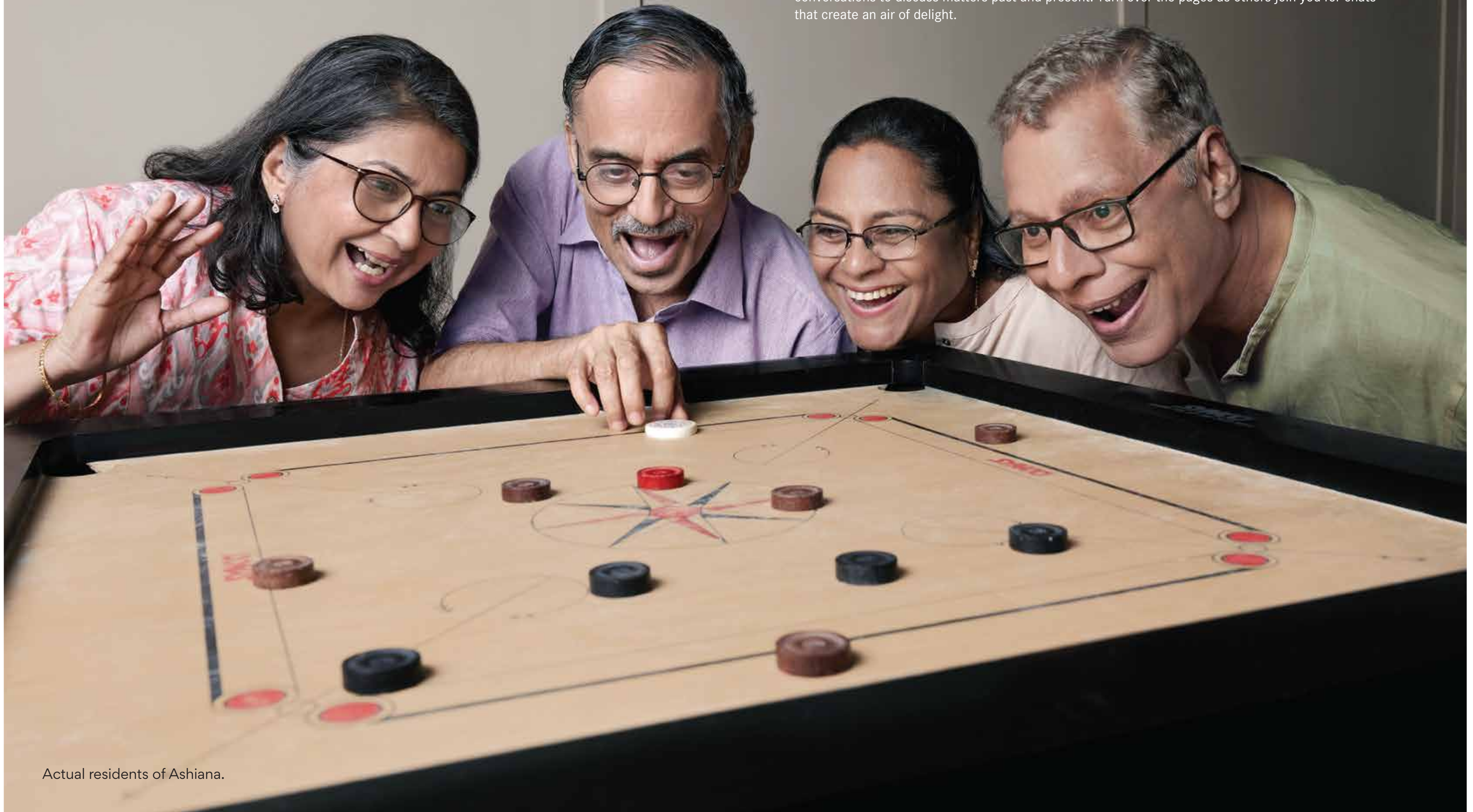
Actual residents of Ashiana.

Let your hobbies be your guide at Ashiana Vatsalya towards further times of pleasure with delightful conversations to discuss matters past and present. Turn over the pages as others join you for chats that create an air of delight.