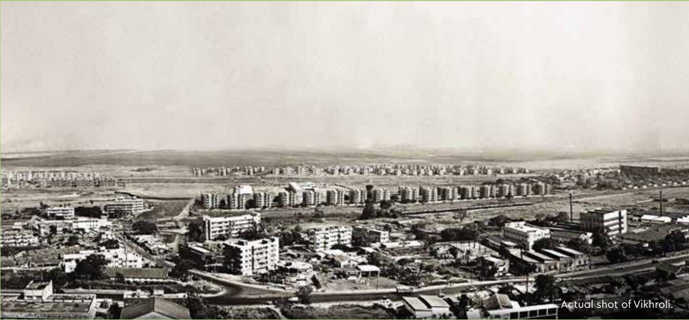
Actual shot of Vikhroli.