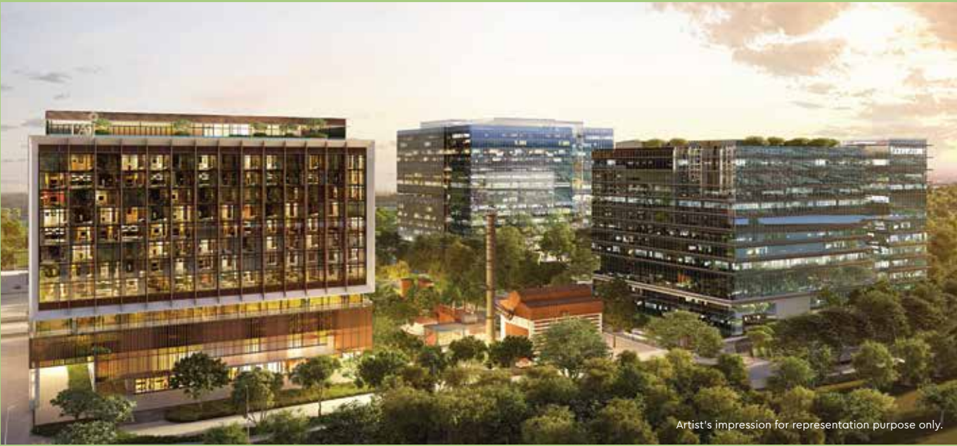
Artist's impression for representation purpose only.

In the 1940s, the founding fathers of the Godrej family developed a whole industrial township in Vikhroli with a remarkable vision to shape a new world in Mumbai. Today, that vision has manifested into reality with thousands of trees greeting you every morning while you are cradled in contemporary comforts amidst nature. Here, a marvellous ecosystem thrives alongside the finest social infrastructure and residential developments, set amidst nature’s rich natural canvas.