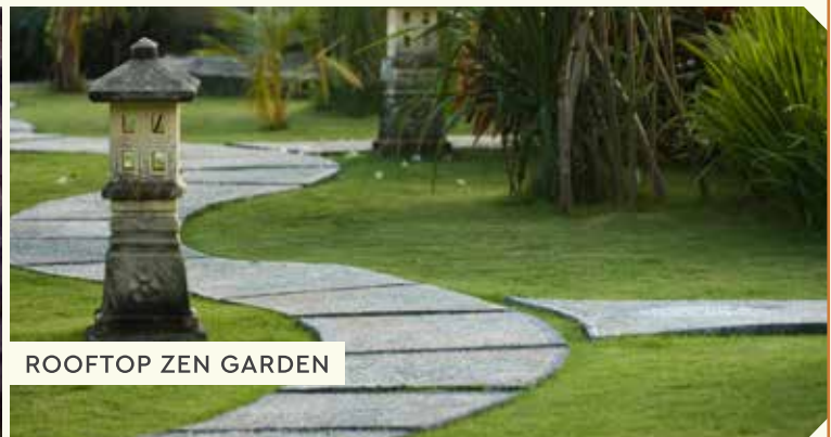
ROOFTOP ZEN GARDEN