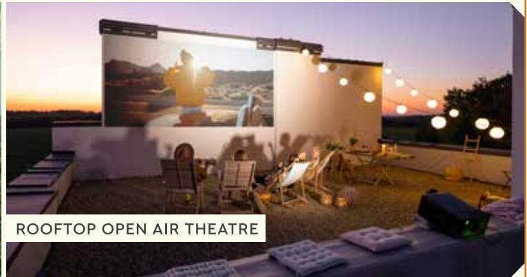
ROOFTOP OPEN AIR THEATRE