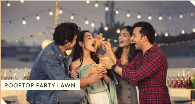
ROOFTOP PARTY LAWN

Whether you want to be active, or just chill out.