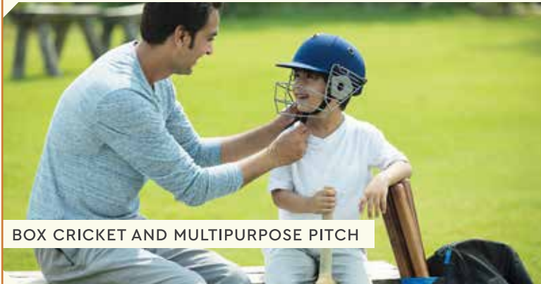
BOX CRICKET AND MULTIPURPOSE PITCH