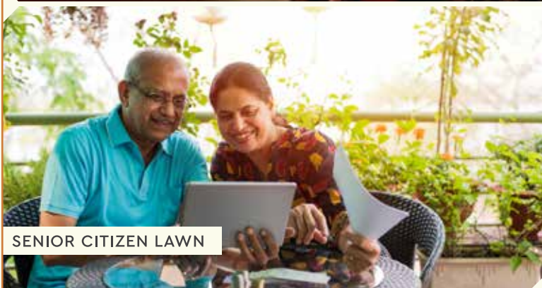
SENIOR CITIZEN LAWN