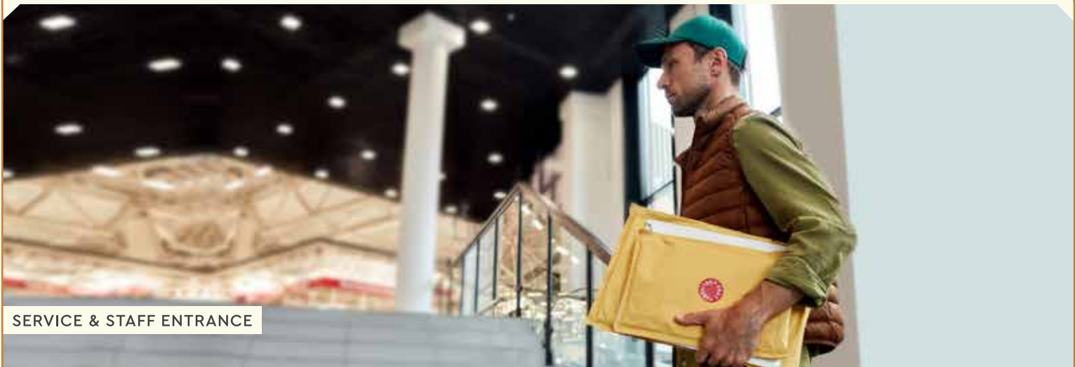
SERVICE & STAFF ENTRANCE