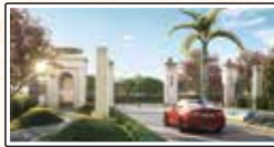
GODREJ PARKLAND ESTATE