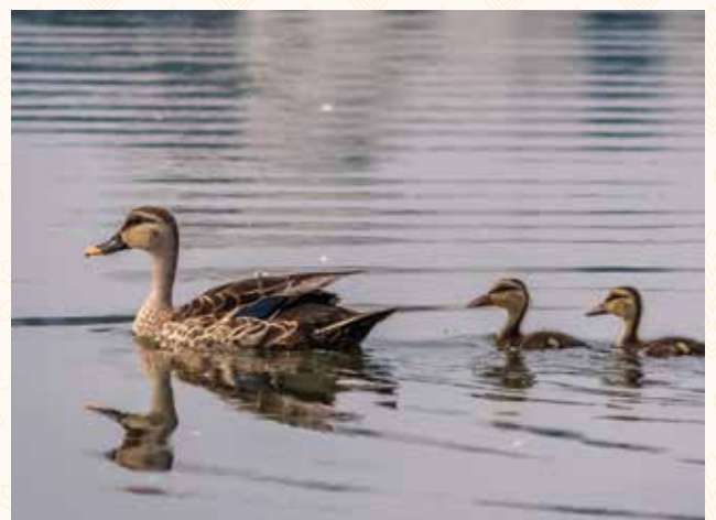
Adjacent to a Serene Pond