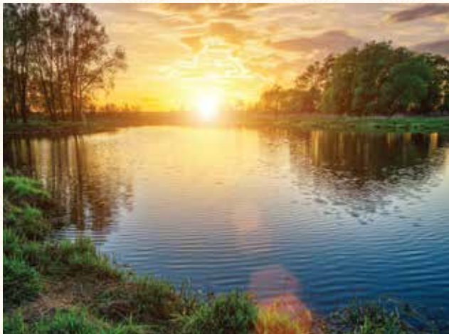
Adjacent to Reserve Forest and Lake