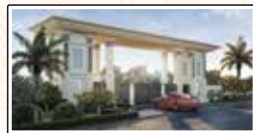
GODREJ GREEN ESTATE