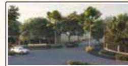
GODREJ ORCHARD ESTATE