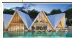
GODREJ COUNTRY ESTATE