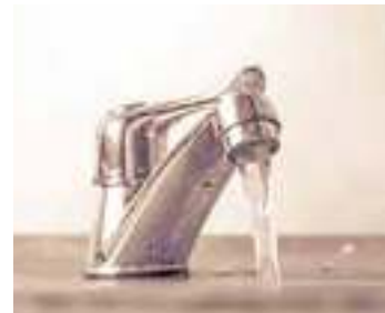
24/7 Water Supply