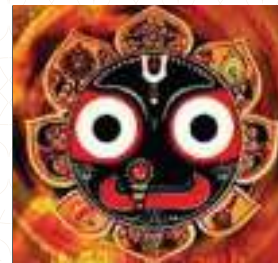
Behera Associates Pvt. Ltd.