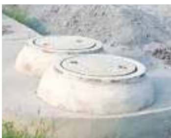
Modular Rain Water Harvesting System