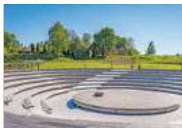
OPEN AIR THEATRE WITH PERGOLA