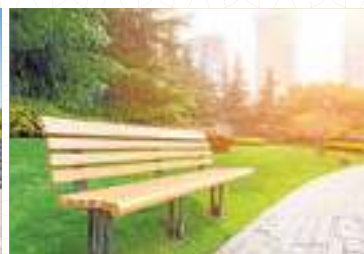
COMMUNITY LAWN WITH BENCHES