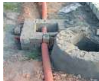
Underground Electricity Supply