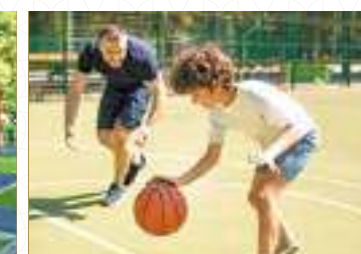
VOLLEY BALL & PRACTICE BASKET BALL COURT