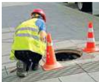
Eco-Friendly Sewage System