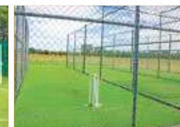
CRICKET PRACTICE NET