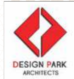
Design Park Architects