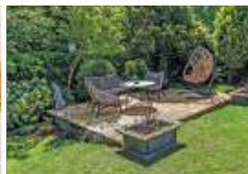
PLANTER WITH SEATING