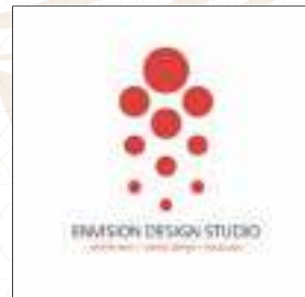
Envision Design Studio