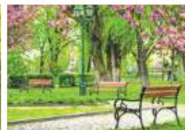
SENIOR CITIZEN AREA/LAWN