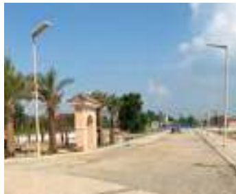
Solar Street Lighting