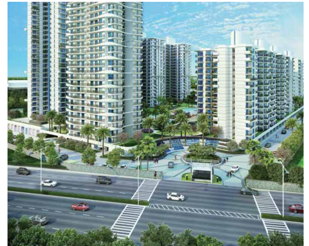
The project is situated on the 30 m wide sector road which is connected to the Gurgaon-Sohna State Highway.