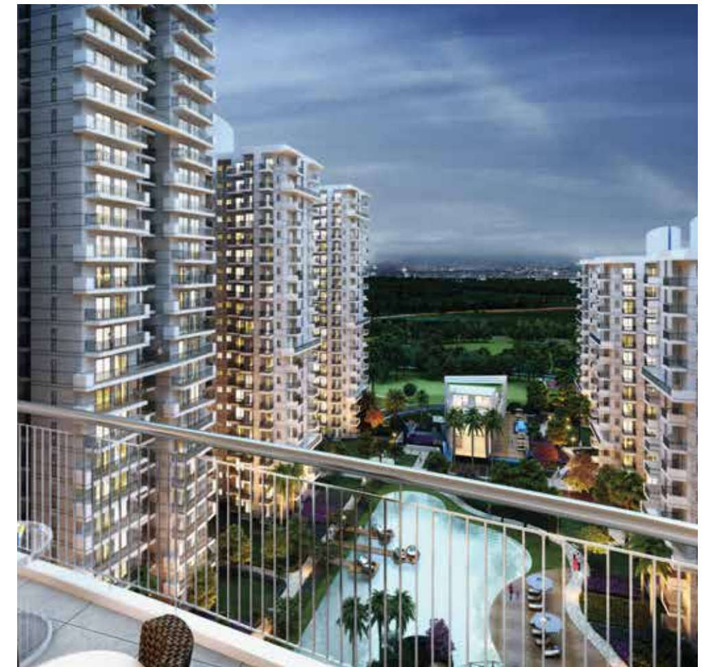
The towers overlooking a vast green central area