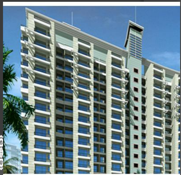
Devika Gold Homz