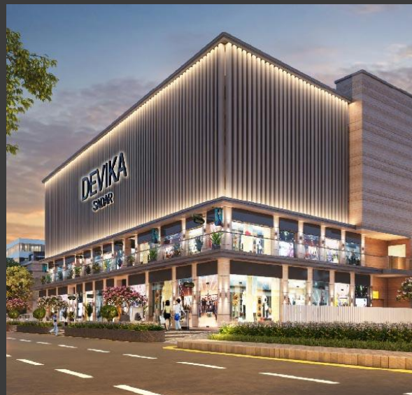
Devika Sadar Bazaar