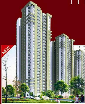
Eldeco Magnolia Park, Sector 119, Noida