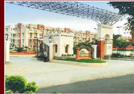
Eldeco Green Meadows, Greater Noida