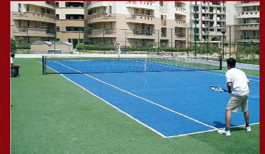
Actual photographs of Eldeco Utopia Club, Noida, already operational