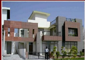
Eldeco County, Sector 19, Sonapat