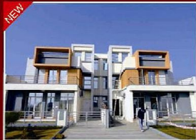
Eldeco Greens, Nakodar Road, Jalandhar