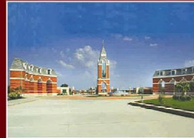
Eldeco Estate One, G.T. Road, Panipat