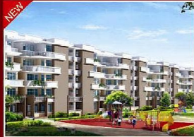
Eldeco Mystic Greens, Sector Omicron, Greater Noida