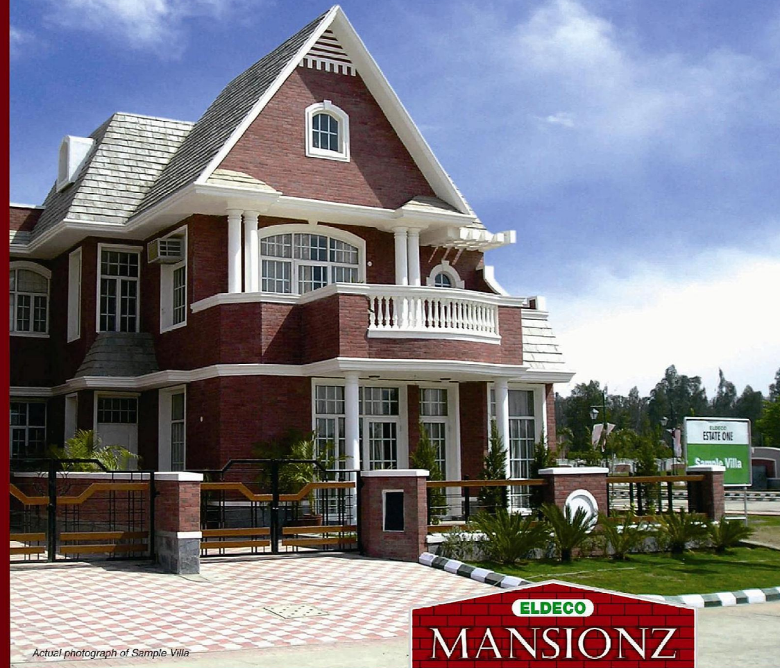
Actual photograph of Sample Villa