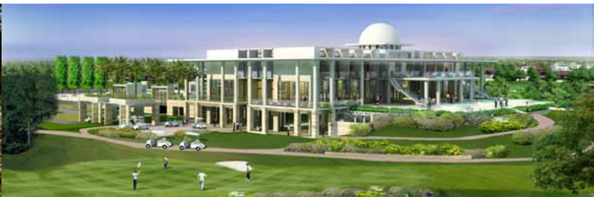
The Imperial Golf Estate*