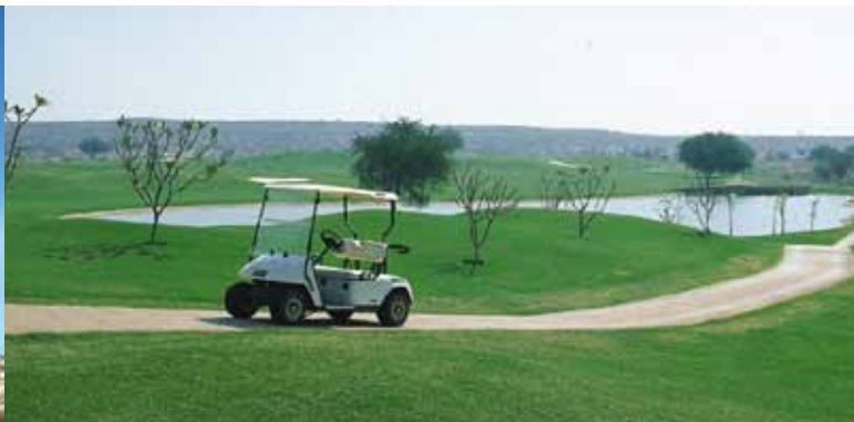
Classic Golf Resort*