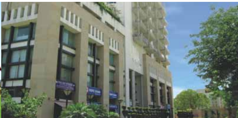
The Peach Tree*