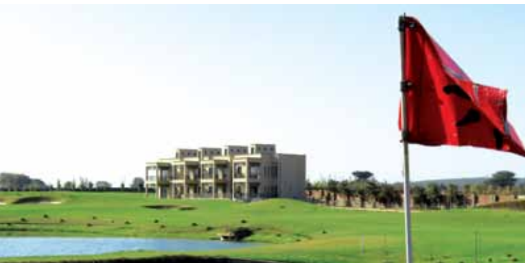
Tarudhan Valley Golf Resort