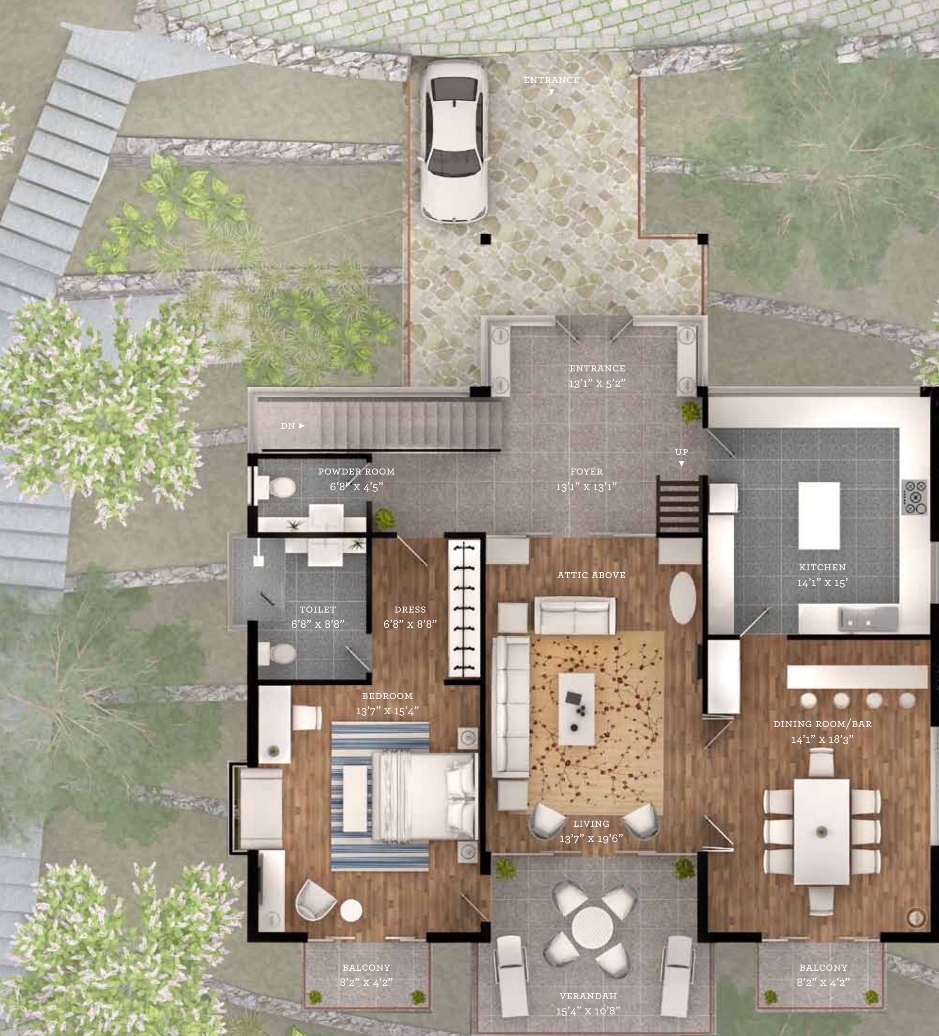
the Deodars ENTRANCE LEVEL