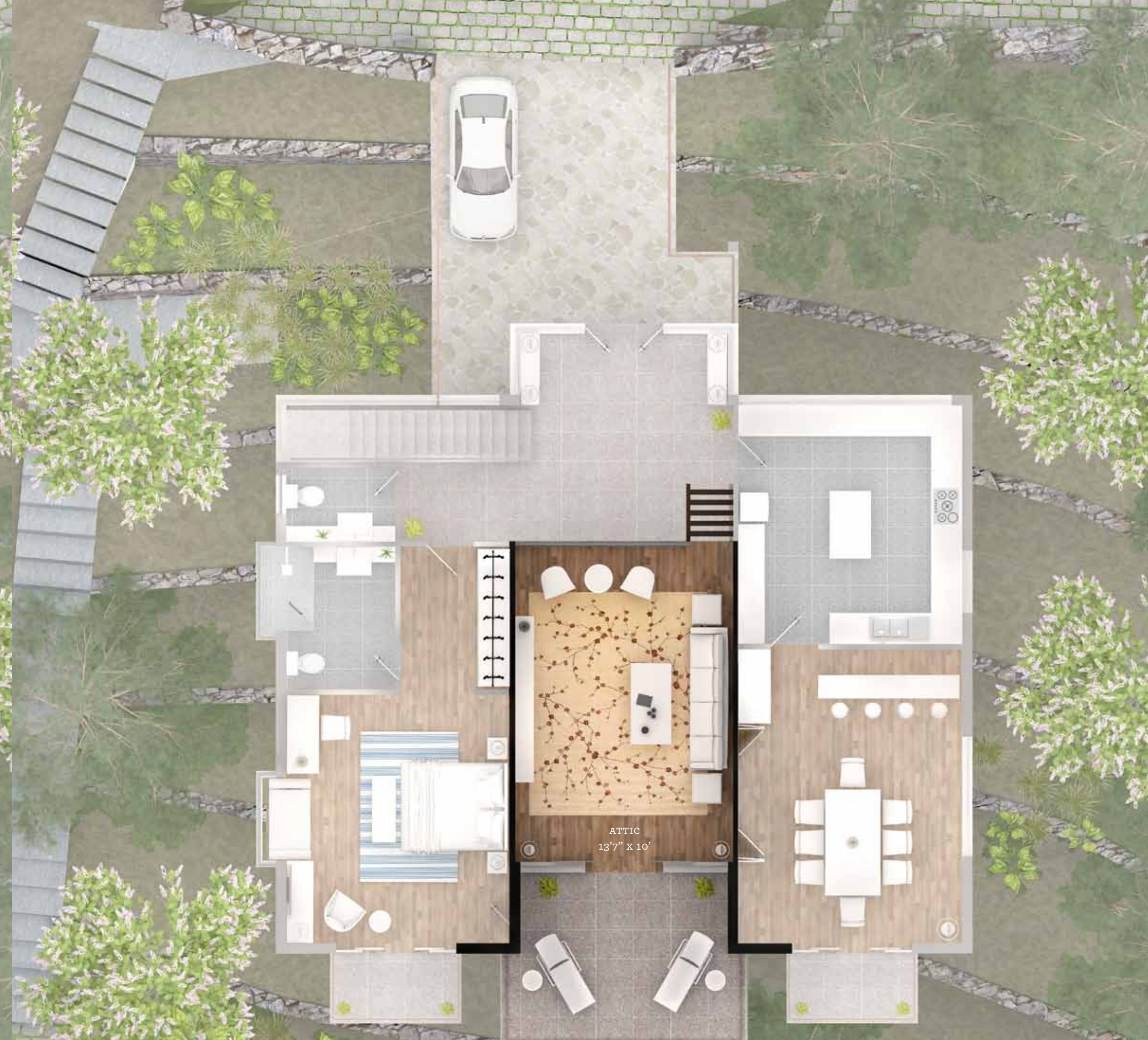
the Deodars ATTIC