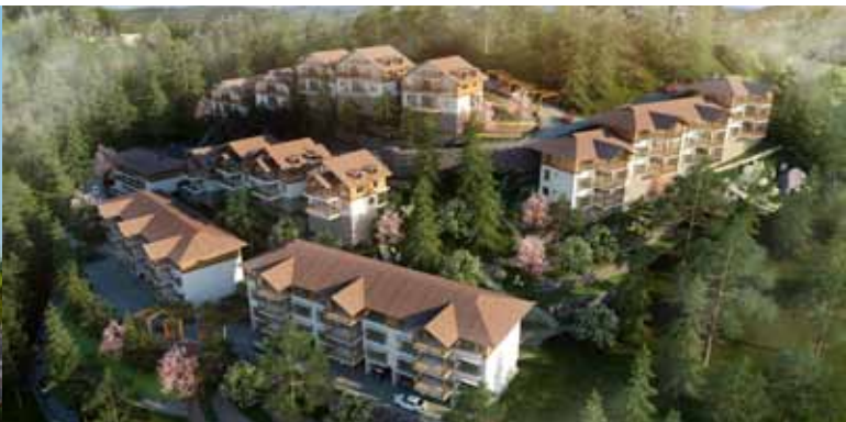
Silverglades Hill Homes