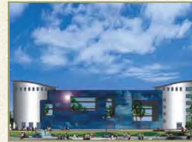
Eldeco The Studio Expressway, Noida