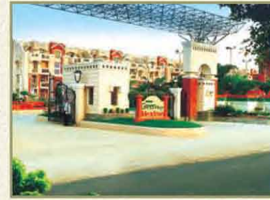
Eldeco Green Meadows, Greater Noida