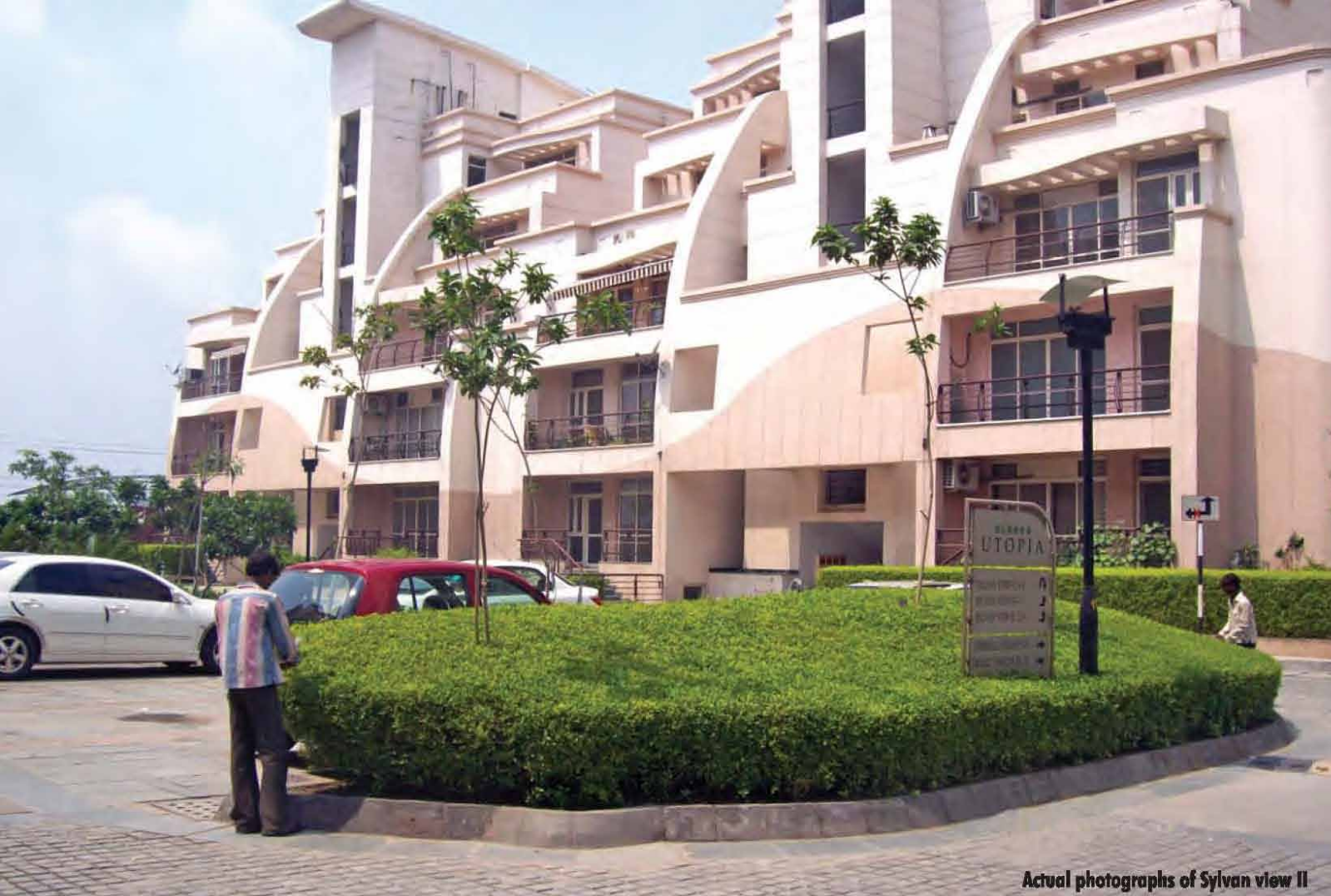
Actual photographs of Sylvan view II