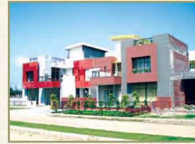
Eldeco County, Sec. 19, G.I. Road, Sonapat