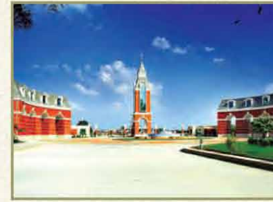
Eldeco Estate One, Sec. 40, G.I. Road, Panipat