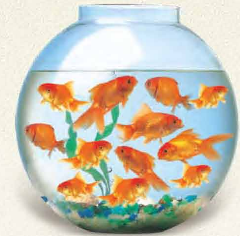
Life at other residential complexes.