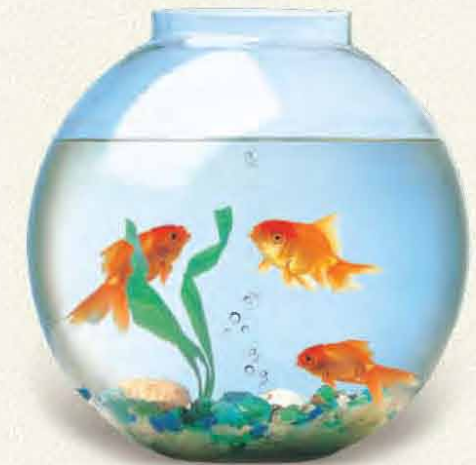
Life at Eldeco Utopia