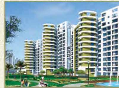
Eldeco Aamantran, Sec. 119, Noida