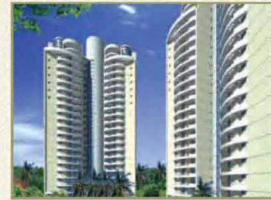
Eldeco Olympia, Greater Noida