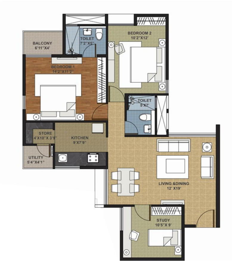
TYPE-2 BHK + STUDY | AREA-1427 SQ. FT. UNIT-1, 2, 5 & 6 | TOWERS-A, B, H & I