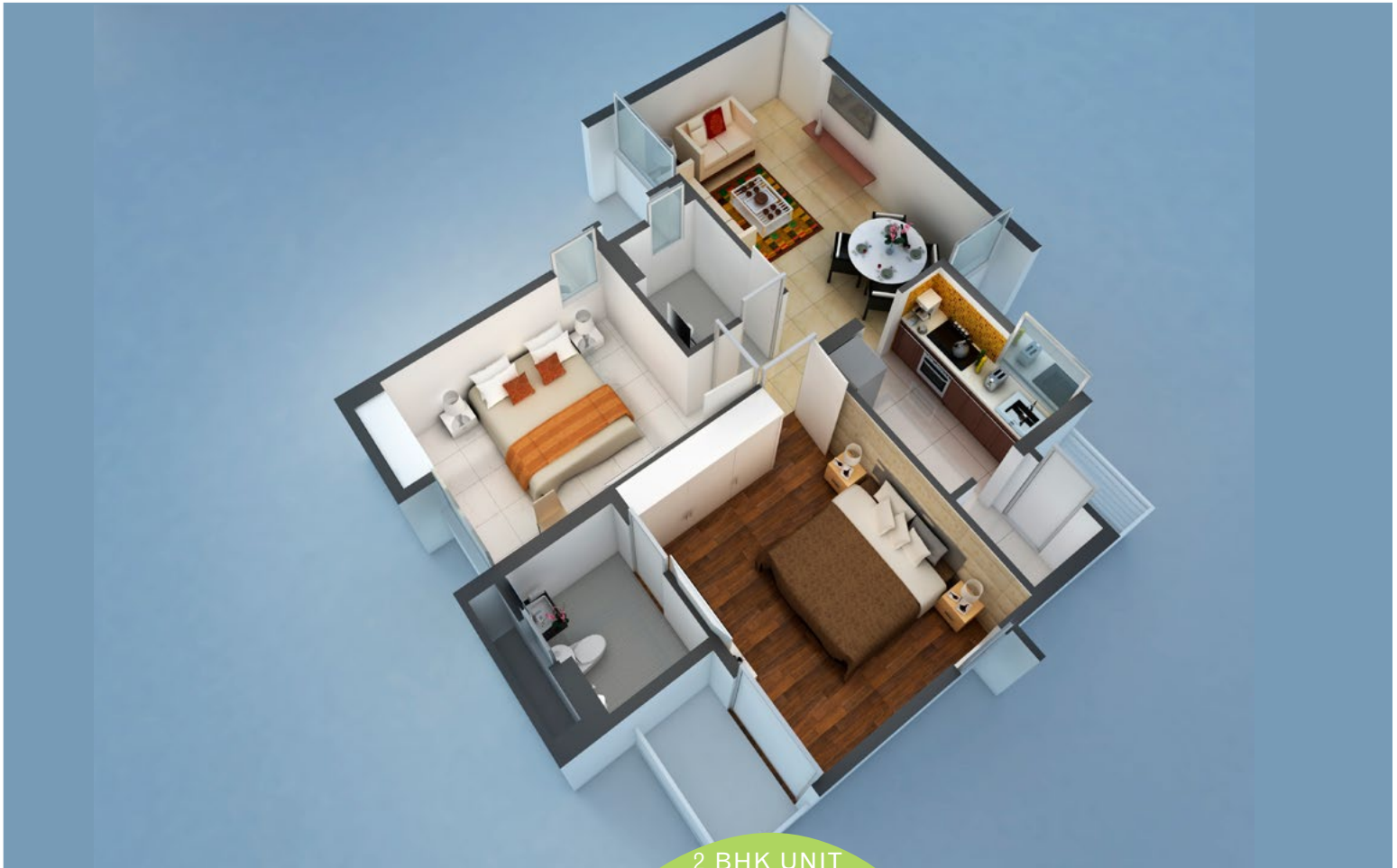
2 BHK UNIT TYPE-1