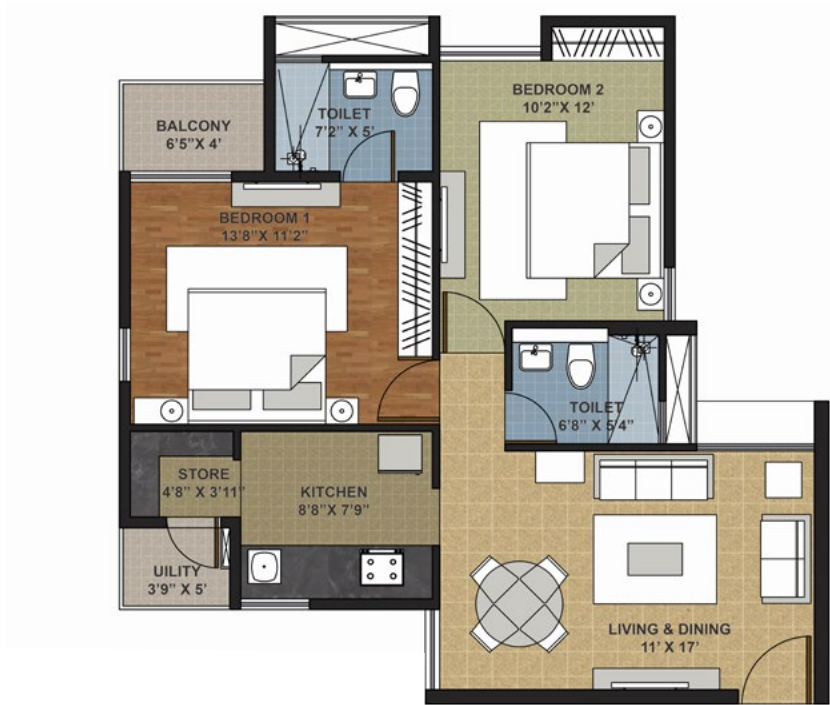
TYPE-2 BHK | AREA-1145 SQ. FT. UNIT-3 & 4 | TOWERS-A, B, H & I