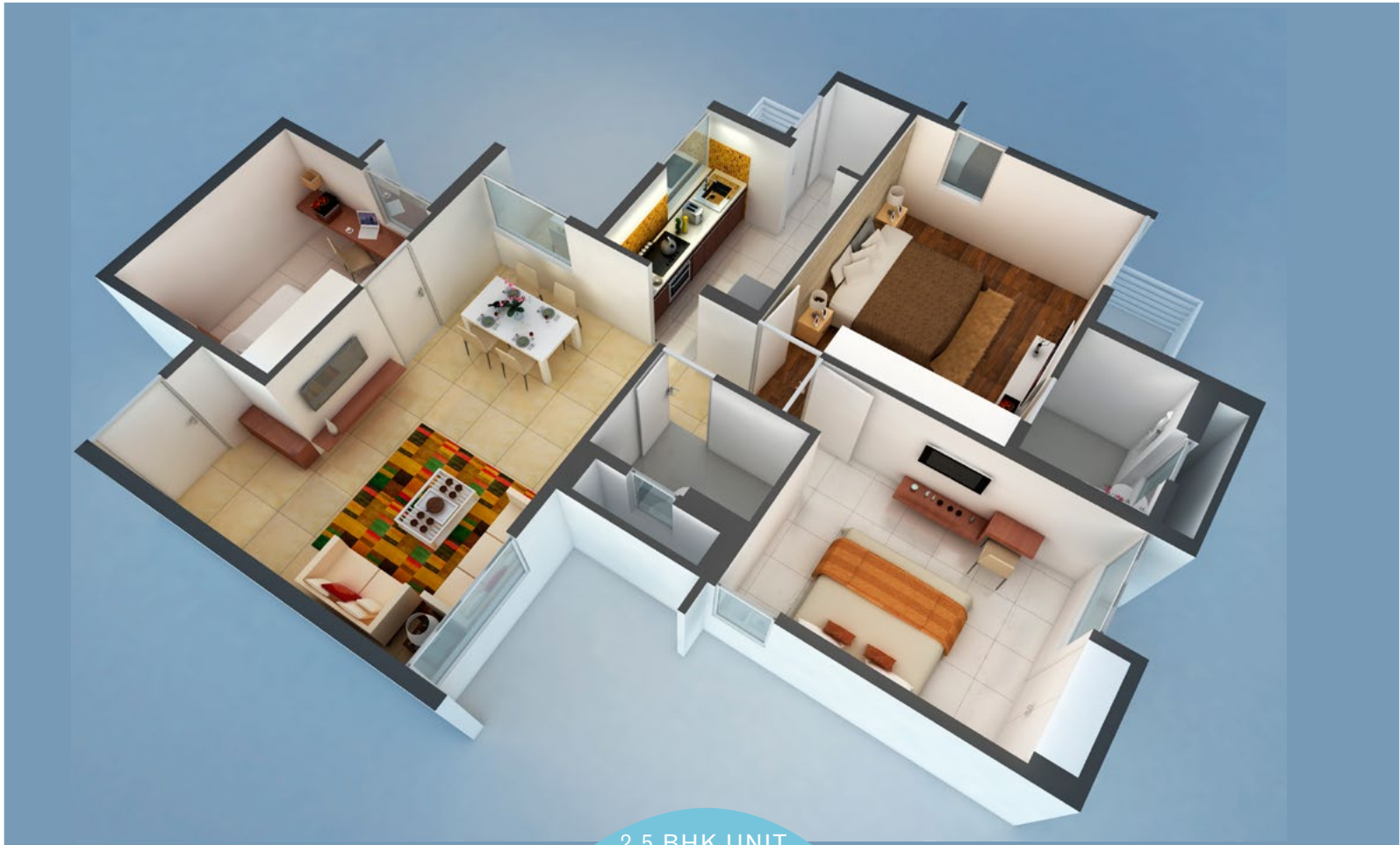
2.5 BHK UNIT TYPE-2